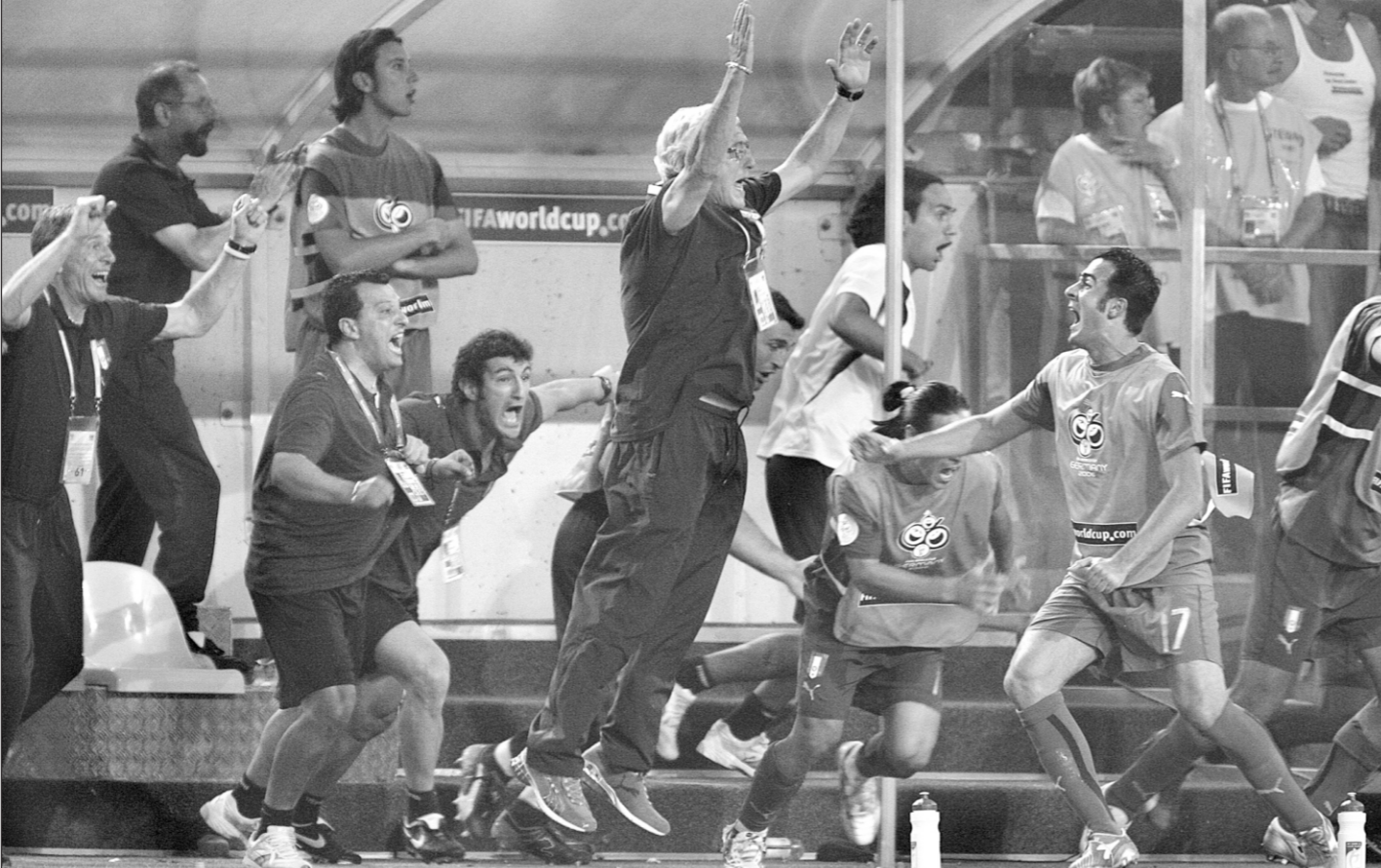
Italy coach Marcello Lippi (C) jumps in joy after his side netted the first goal against Germany in the semifinal at Dortmund's Westfalen Stadion on Tuesday.

AFP, Berlin German fans vandalised Italian restaurants and torched garbage bins after the host nation was defeated by Italy in the World Cup semifinals, police said on Wednesday.