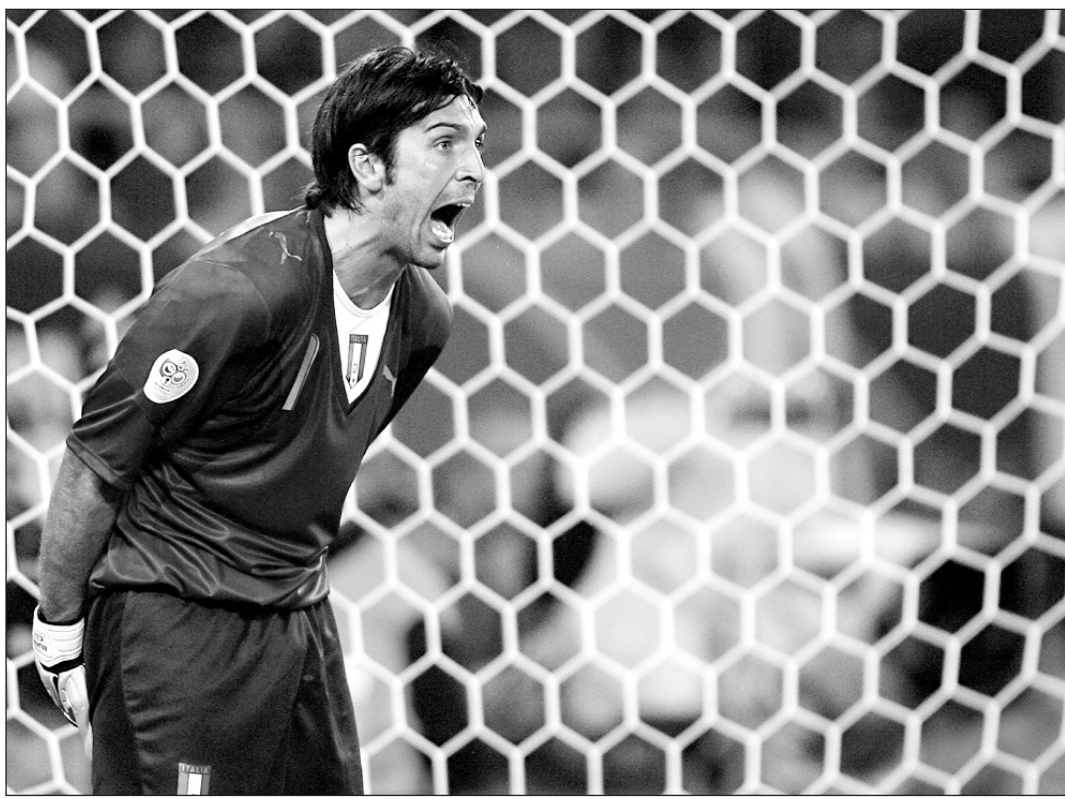
Italy custodian Gianluigi Buffon shouting at teammates during the match against Ukraine in Hamburg on Friday.

The Fan Mile was expanded due to its enormous popularity and some 900,000 people are expected for the Germany v Italy semifinal Tuesday.