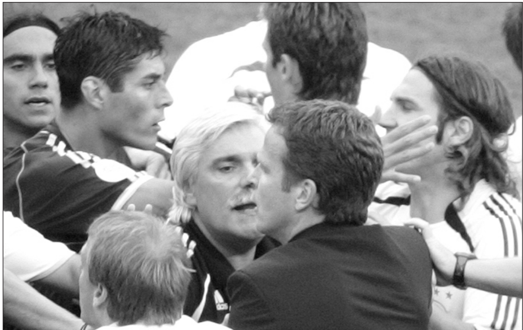
A file photo shows German midfielder Torsten Frings (R) in a tussle with Argentine striker Julio Cruz (2nd from left) after the end of their quarterfinal match in Berlin on June 30.

A still image of Frings's outstretched arm was also published in the Italian newspaper La Repubblica and on Monday the paper wrote that