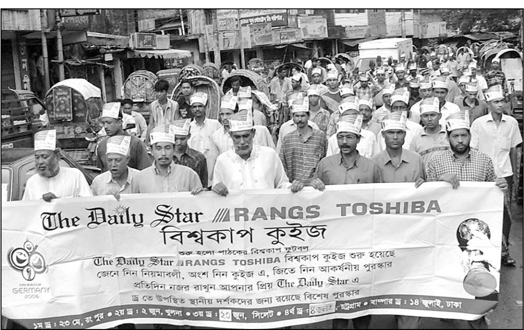
A colourful procession was brought out in Chittagong yesterday on the eve of today's draw ceremony of The Daily Star-Rangs Toshiba World Cup Quiz Round 4.

STAFF CORRESPONDENT, Chittagong Hundreds of sports lovers brought out a colourful procession in the port city yesterday to mark The Daily Star-Rangs Toshiba World Cup Quiz Round-4 draw.