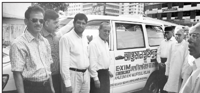
Export Import (EXIM) Bank of Bangladesh Ltd donated an ambulance to Anjuman Mufidul Islam, an Islamic voluntary organisation providing humanitarian services for the poor, at a function in Dhaka on Friday. Senior officials from both the sides were present.