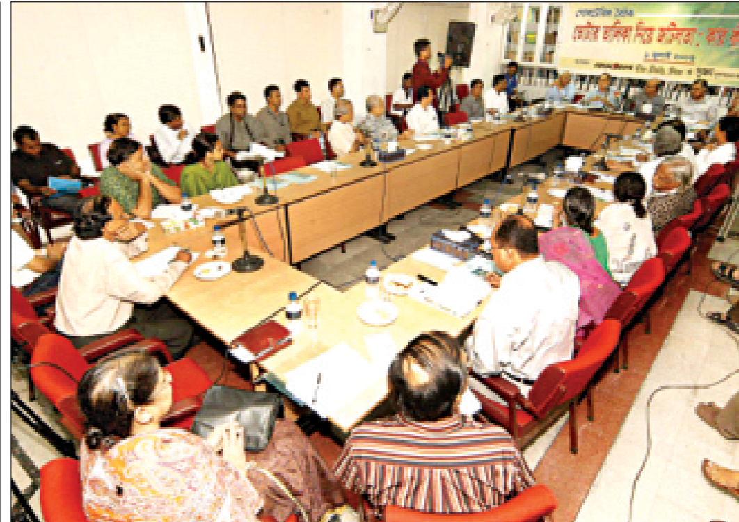
Participants of a roundtable discussion jointly organised by the daily Prothom Alo, Shushashoner Janney Nagarik and The Daily Star at the latter's conference room yesterday.