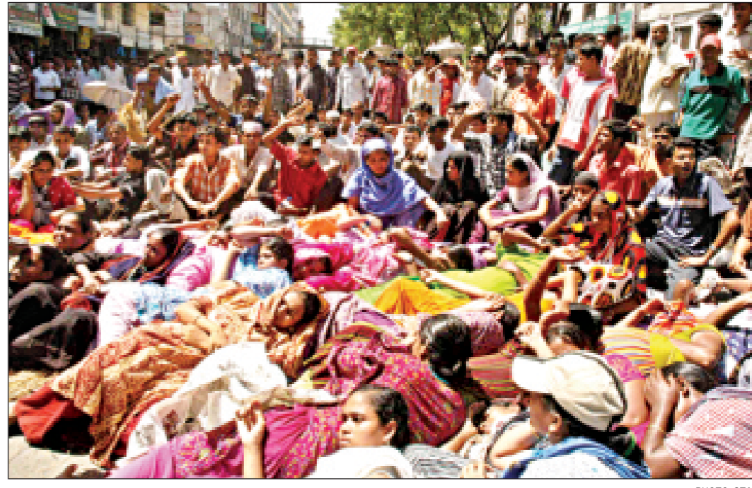
Workers of SQ Sweaters Ltd stage a sit-in on Rokeya Sarani in the capital's Mirpur area yesterday, demanding a meeting with the owners and realisation of their nine-point demand.