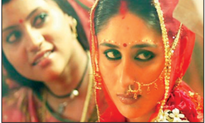
Konkana Sen (L) and Kareena Kapoor in Omikara