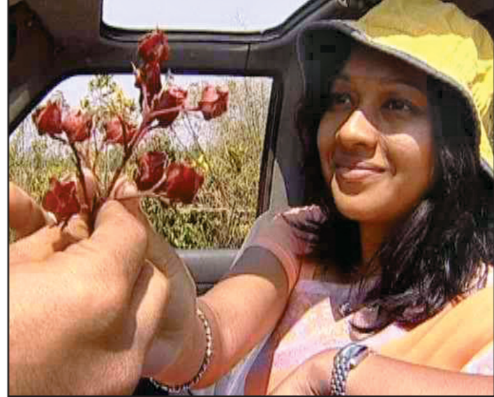
A scene from Bonophool