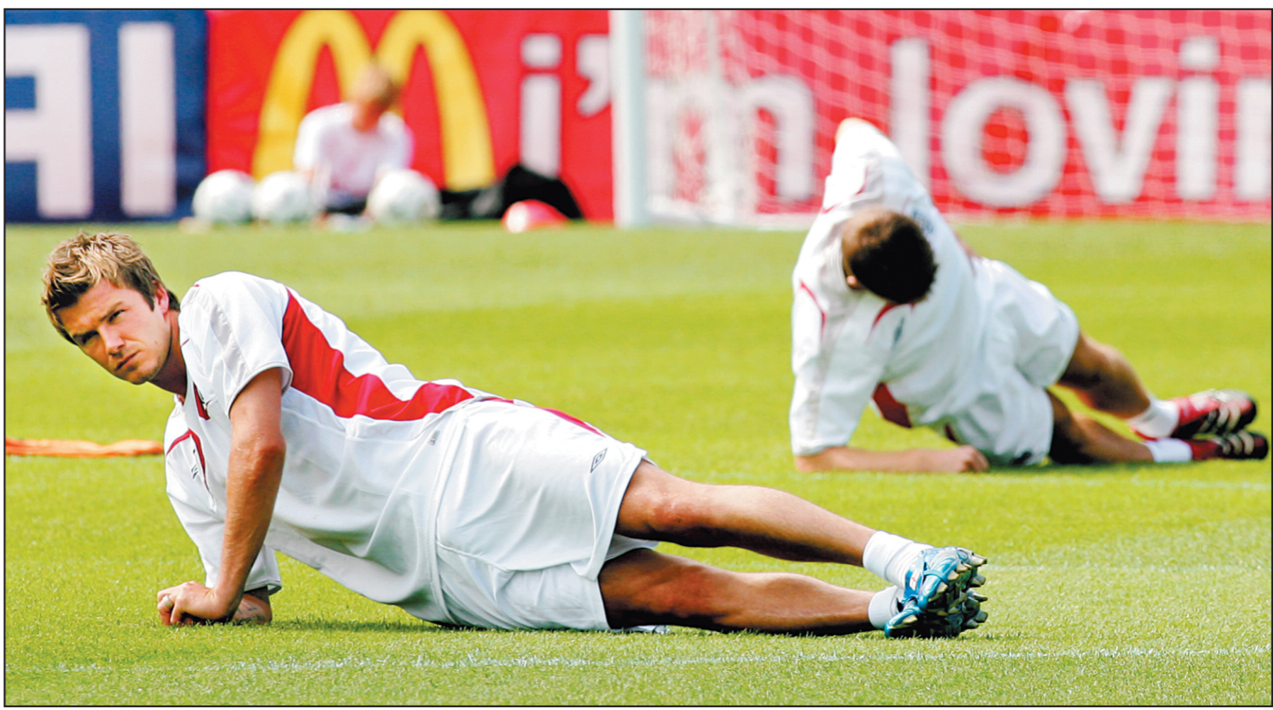
FREING HIMSELF FOR ANOTHER TRADEMARK FREEKICK: England captain David Beckham doing push-up sideways during a training session at Mittelbergstadion in Buhlertal on Thursday.

ing. And if I haven't changed by now then I probably never will. Yet regardless of whether Eriksson's management is to blame, it is undeniable that England have been far less than the sum of their parts in four matches so far.