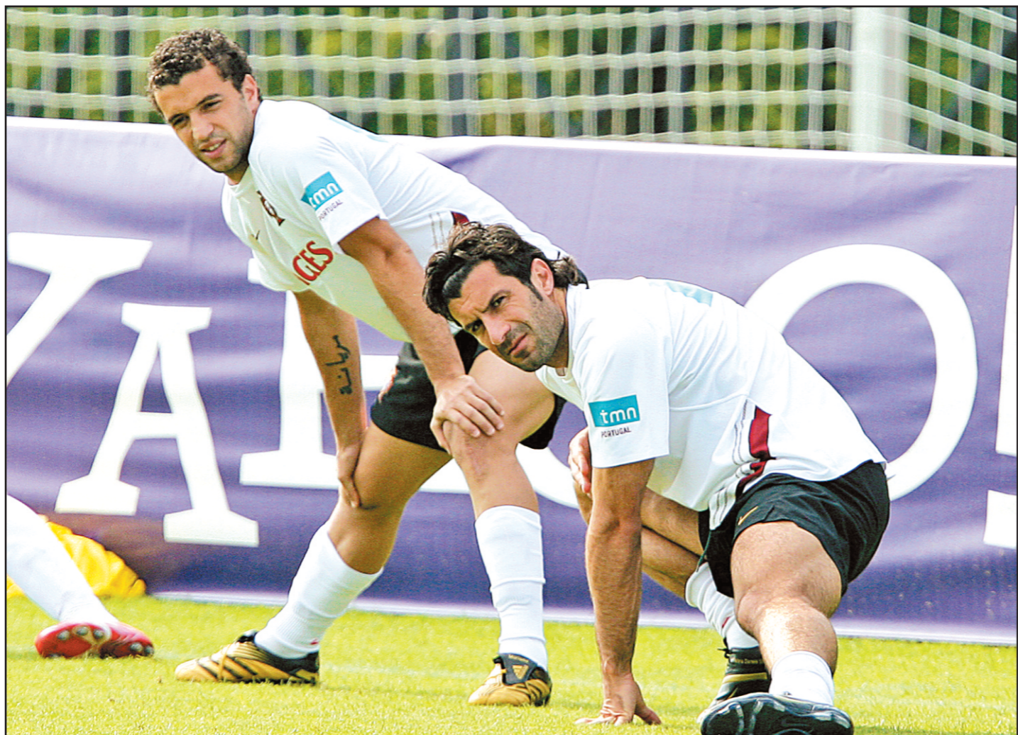
LOOKING BEYOND ENGLAND? Portugal's playmaker Luis Figo (R) and Simao Sabrosa stretch ahead of the team's training session in Mariefeld on Thursday. Portugal face off England in the quarterfinal in Gelsenkirchen today.

practise. "I think Ricardo is good at stopping penalty kicks. But it depends on a lot of things at that moment." Figo also vowed to put his personal friendship with his England counterpart David Beckham to one side.