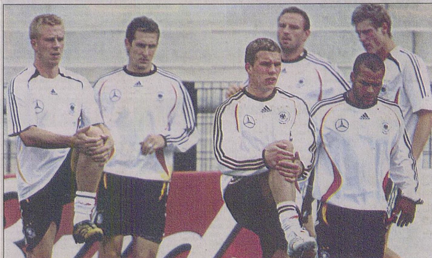
ONE FOOT IN THE SEMIS? German footballers (L-R) Mike Hanke, Miroslav Klose, Lukas Podolski, Jens Nowotny, David Odonker and Marcell Jansen warm up for Wednesday's training session at Wurfplatz Stadium in Berlin.