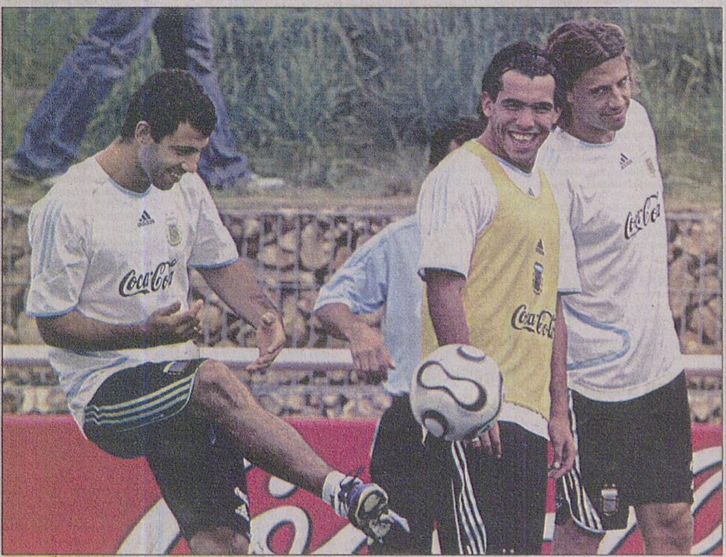
YES, PASS-THE BALL LIKE THIS: Argentina midfielder Javier Mascherano (L) kicks the ball while forwards Carlos Tevez and Hernan Crespo (R) look on at HerzogsPark training camp in Herzogenaurach on Thursday.