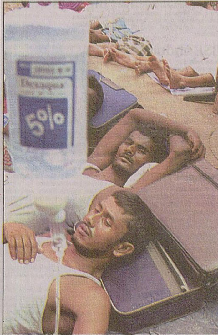
Teachers of Ibtedayee madrasas continue their fast unto death at Muktangan in the capital yesterday to realise their seven-point demand.