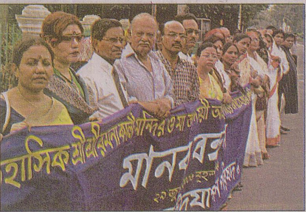
Puja Udjapan Parishad members form a human chain in front of the High Court yesterday to protest the bid to relocate Ramna Kali Mandir, an old Hindu temple in the capital.