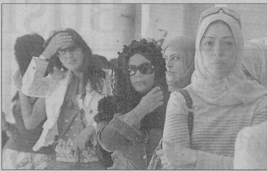
Kuwaiti women queue at a polling station in Kuwait City to vote for the first time in parliamentary elections yesterday. Twenty-eight women are among 249 candidates running for the 50-seat legislative body.

Dalman said Iranian Red Crescent groups have been sent to the area.