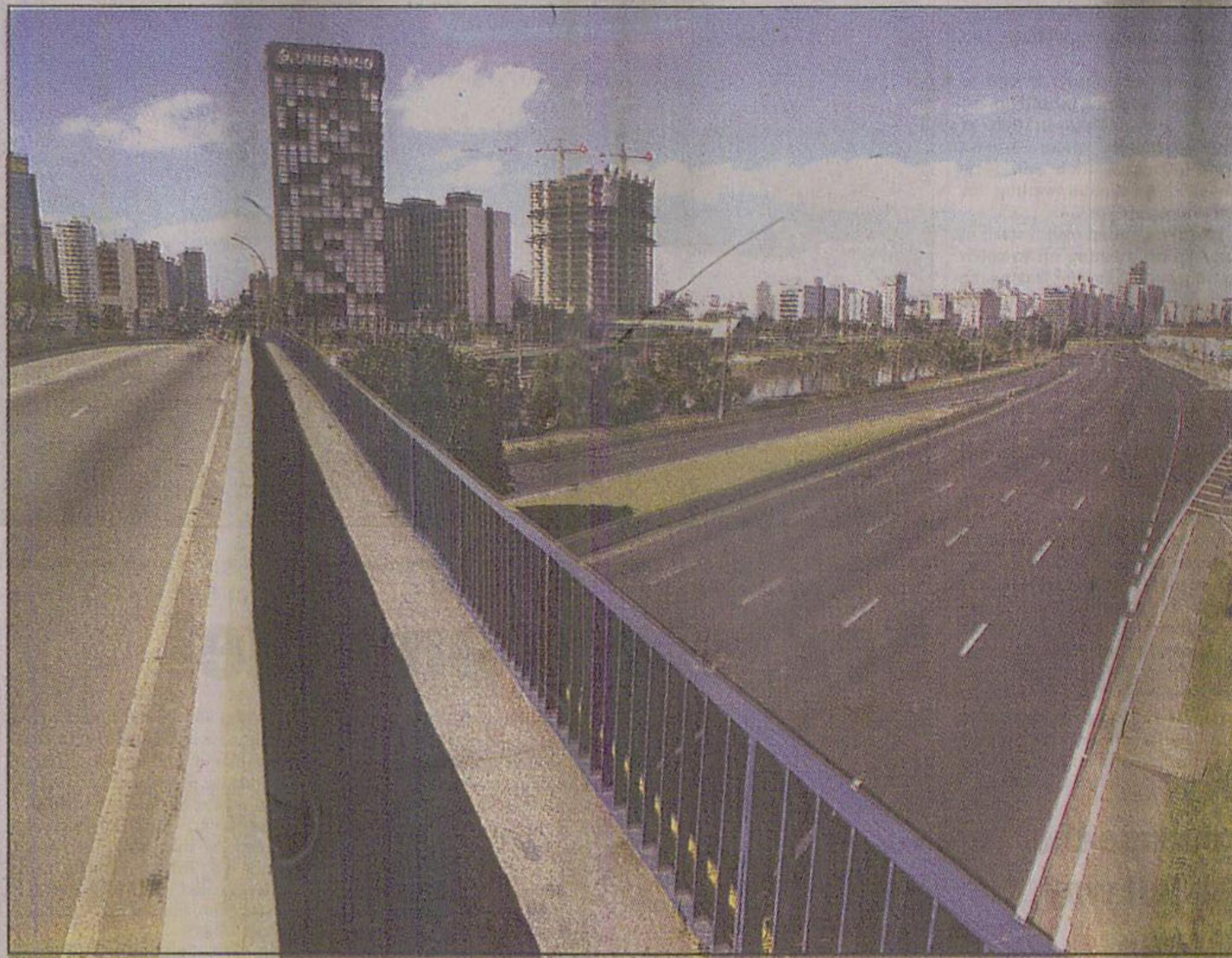
HARTAL IN BRAZIL! One of the busiest expressways of Sao Paulo, a Brazilian city, is devoid of any traffic during the World Cup round of 16 match between Brazil and Ghana on Tuesday.