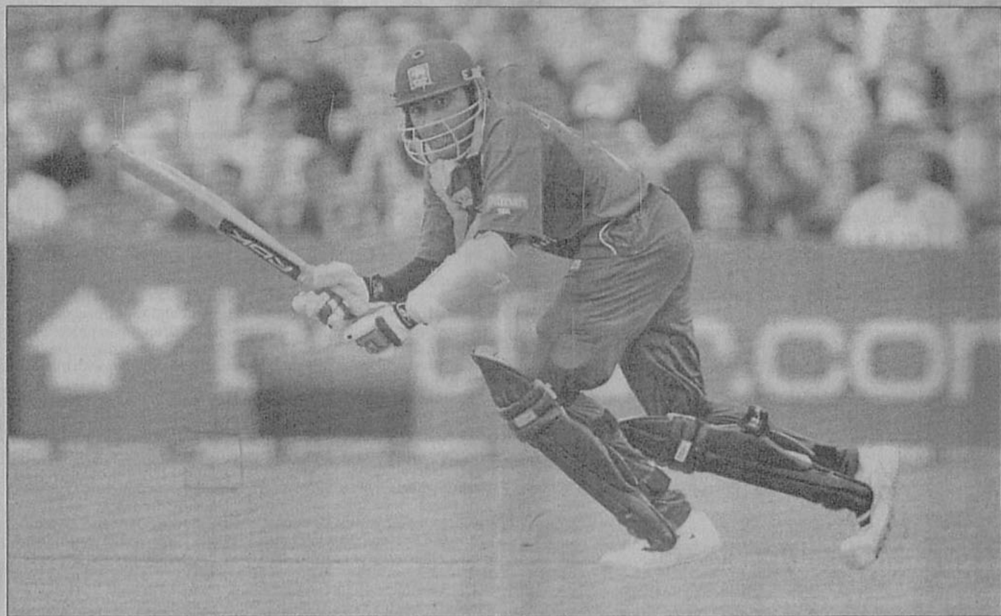
Sri Lanka skipper Mahela Jayawardene flicks to the on-side on his way to a century during the fourth one-day international against England in Manchester on Wednesday.

STAR Sports Wimbledon Championships Second Round Live at 5:00 pm