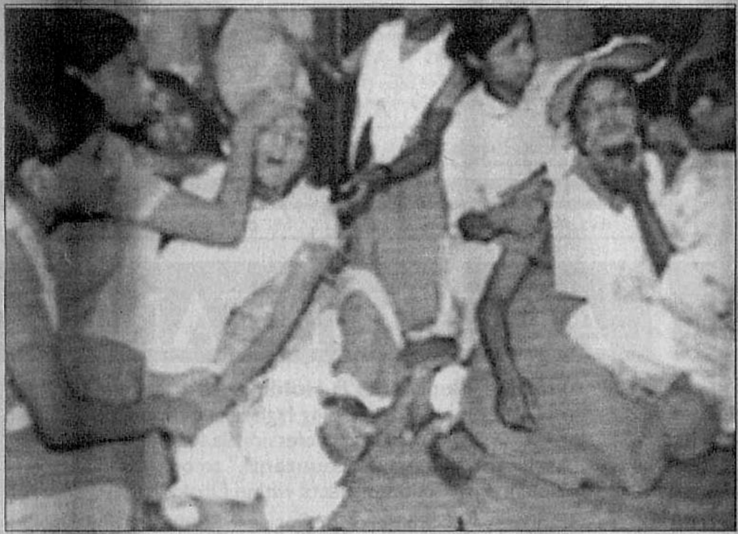
Classmates trying to comfort two girls after they fainted at Sabdalpur High School on Tuesday.