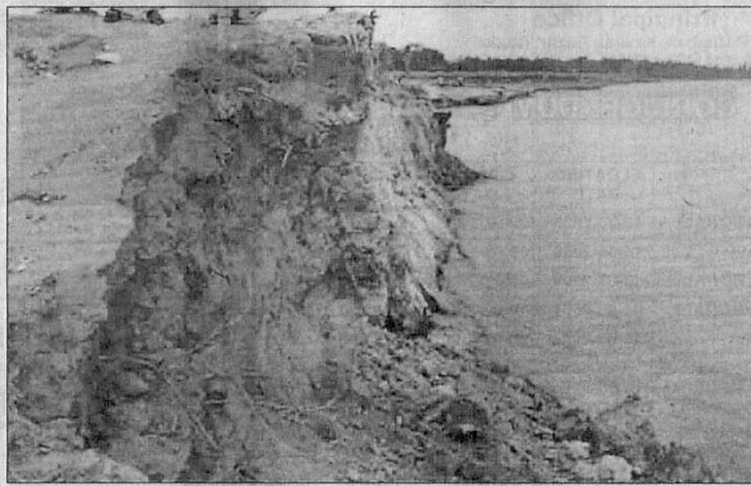
Unabated erosion by the mighty Jamuna displaced several hundred families in five upazilas of Sirajganj district in about a fortnight. The photo was taken from Shailabari in the Sadar upazila.

All the fourteen students are now absconding, the sources said.