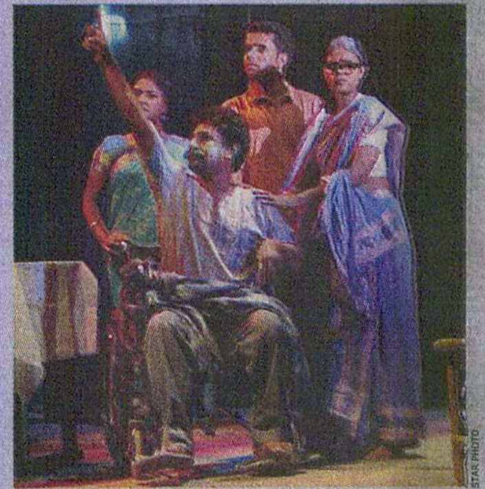
A scene from the drama "Bela Shesher Galpa" staged at a drama festival at Chittagong Shilpakala Academy on Friday. Nandimukh organised the drama festival titled, "Nandimukh Natya Utsab".