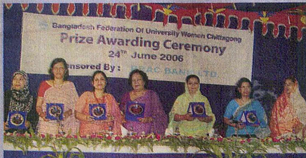
Recipients of awards with crests in hand pose for photograph at a prize distribution ceremony at Chittagong Club on Saturday. Bangladesh Federation of Women University Chittagong organised the ceremony sponsored by Brac Bank Limited.

Distinguished persons of the city, elected representatives, NGO organisers, human rights workers, women leaders and representatives of workers and rickshawpullers were present at the workshop.