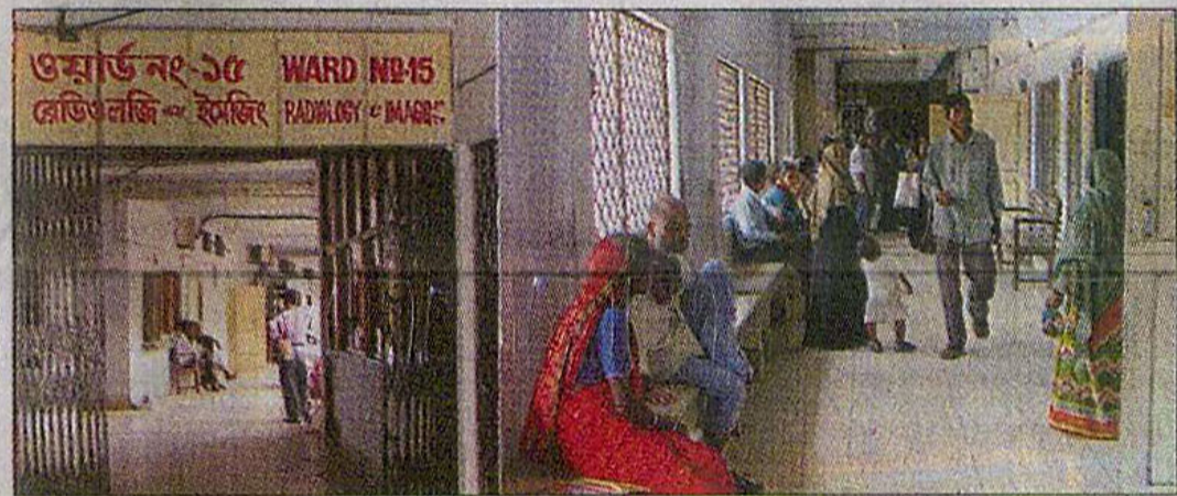
Radiology and Imaging Department, left, of Chittagong Medical College Hospital and poor outdoor patients, right, wait in a corridor.