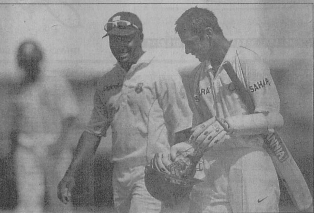
WE DID IT AGAIN! Opposing captains Brian Lara (L) and Rahul Dravid shares a laugh at the end of the drawn third Test between West Indies and India at the Warner Park Stadium in St. Kitts on Monday.