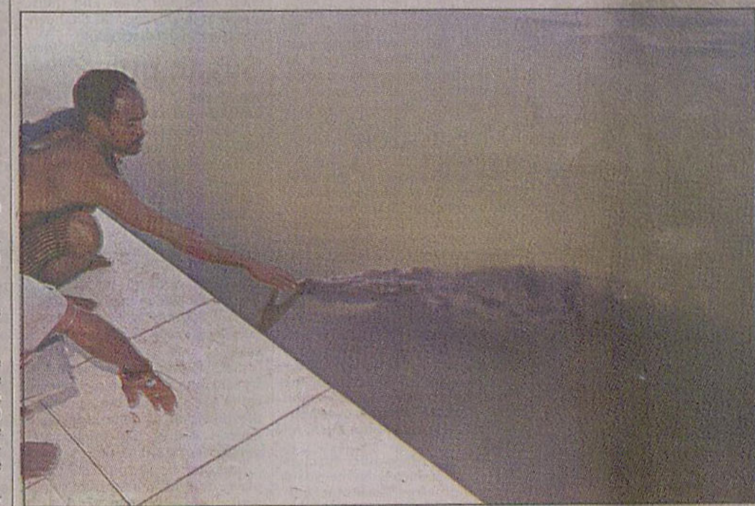
One of the five sweet-water crocodiles brought from Chennai and released in the pond at Khan Jahan Ali shrine in Bagerhat last year.

Twenty-two Iraqis, including children, were killed when a motorbike bomb exploded in a market square where villagers were watching a World Cup football match Monday, according to a new toll Tuesday. The booby-trapped motorcycle exploded in the midst of a crowd of youngsters packed into the square in the Shiite village of Khairnabat near Baquba, some 70 kilometres (44 miles) north-east of Baghdad to watch the Italy-Australia clash. "Many young men and children were among the dead," a security source said. About 40 people were also injured in the blast. The source said tensions were running high in impoverished Khairnabat, with villagers brandishing weapons fearing further attacks by rebels during the funeral for the victims. The Baquba area, with its explosive mix of Sunnis and Shiites, is one of the main fronts in the sectarian violence ravaging Iraq. At almost the same time as the Khairnabat attack, a home-made bomb exploded in the main market in Hilla, 100 kilometres (60 miles) south of Baghdad, killing 10 people and wounding at least 79, according to the latest toll provided by the hospital Tuesday. The attacks came one day after Prime Minister Nuri al-Maliki unveiled a national reconciliation plan aimed at stemming the bloodshed.