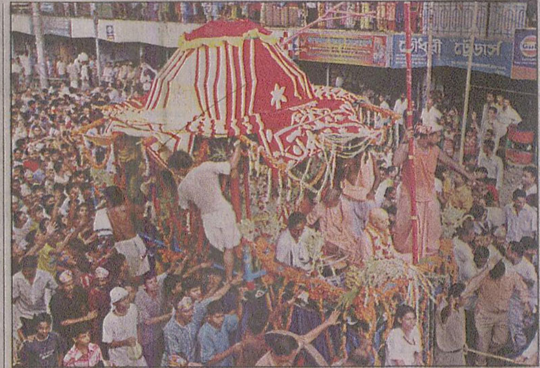
Thousands of Hindu devotees take part in a traditional Rath Jatra (chariot procession) at Swamibagh in the capital yesterday.

Foreign Minister M Morshed Khan yesterday criticised foreign diplomats severely for violating diplomatic norms and poking nose into Bangladesh's internal affairs of politics, election and system of government. "This is beyond diplomatic niceties," he said adding, "there is internationally recognised diplomatic norms and practices, but sometimes we find breach of that and that's why we have reacted sternly." Talking to the members of the Diplomatic Correspondents Association of Bangladesh (DCAB) at state guesthouse Padma over a lunch, Morshed reminded that diplomacy is not bilateral or tripartite bargaining and main functions of diplomats are to strengthen the relations and increase trade and economic cooperation among the countries.