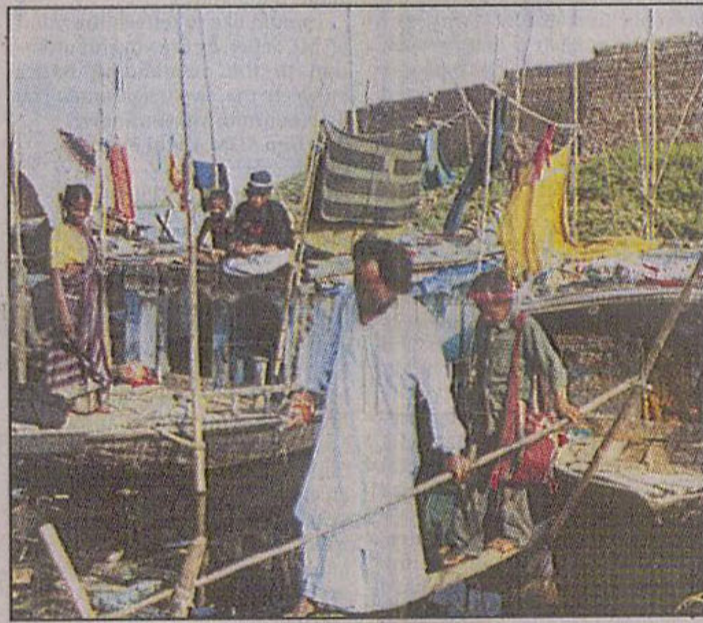
A depiction of the lifestyle of gypsies