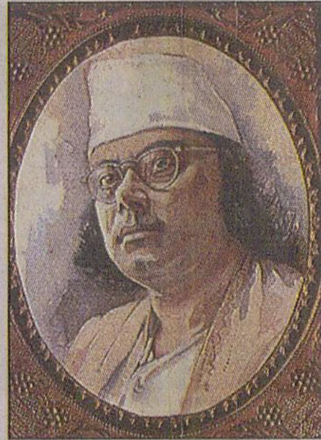
Portraits of Omar Khayyam and Kazi Nazrul Islam