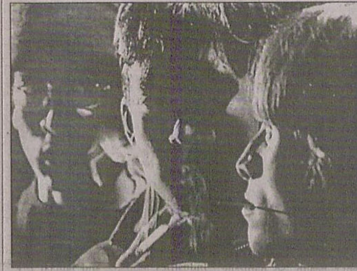
The dark side of drug abuse portrayed in the TV play