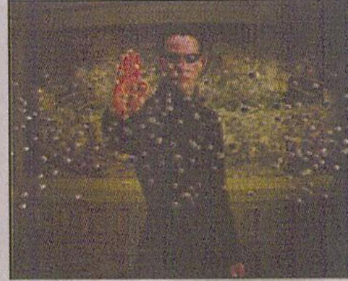
The Matrix Revolutions On HBO at 09:30 pm Genre: Action/Adventure Cast: Keanu Reeves, Laurence Fishburne