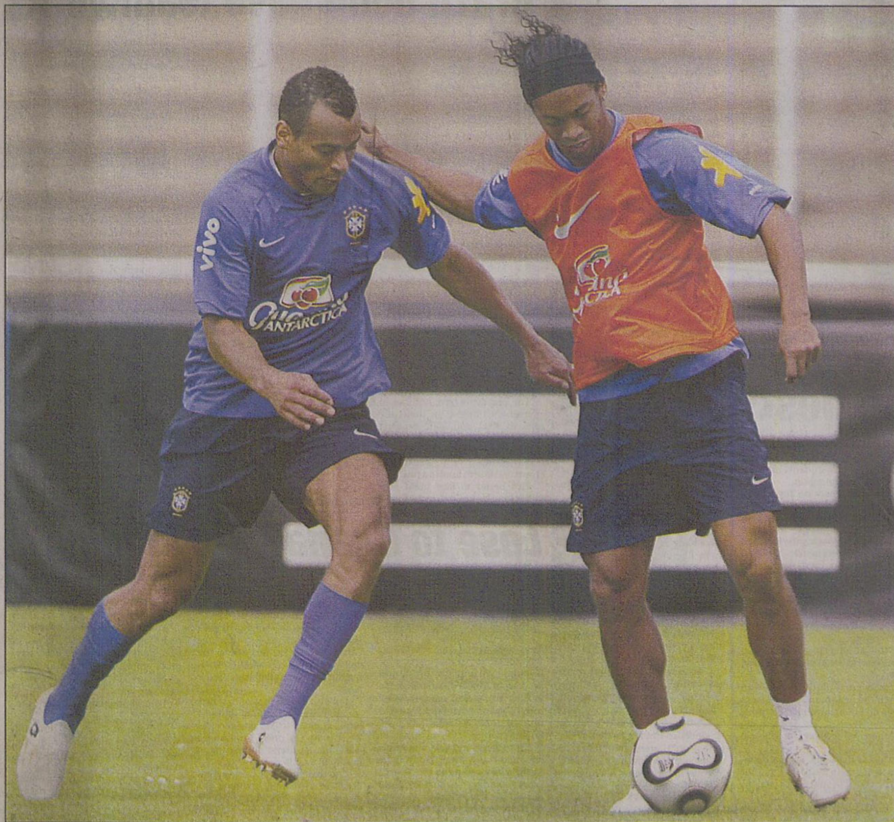
ON THE RECORD TRAIL: Brazil captain Cafu (L) fights for the ball with Ronaldinho during a training session at Bergisch Gladbach Stadium on Sunday.