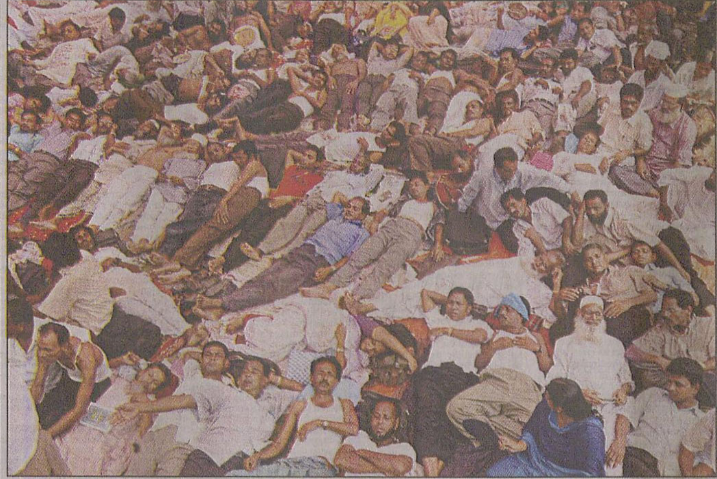
Hundreds of government primary school teachers continue their fast-unto-death at Muktagong in the capital yesterday.