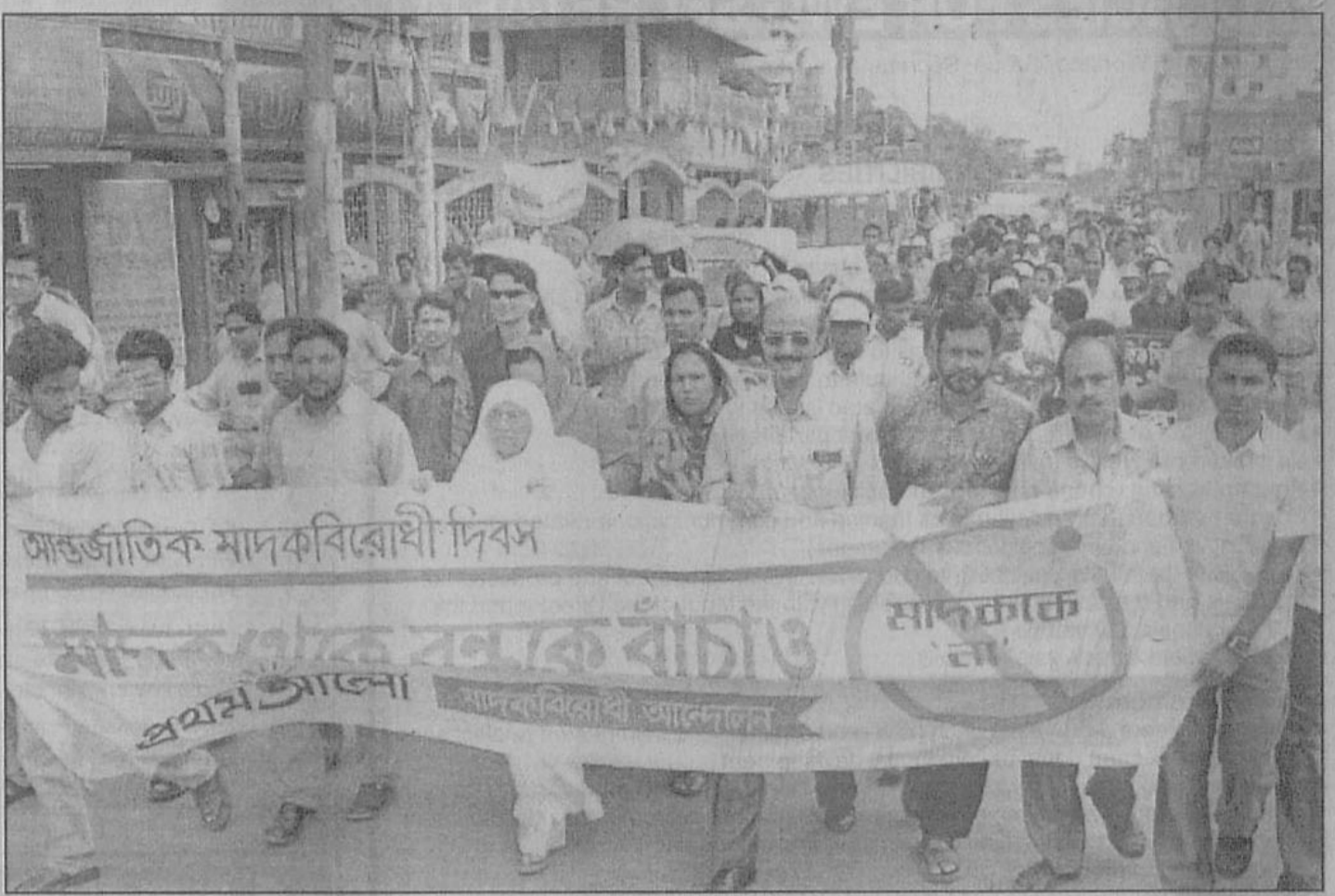
The Prothom Alo Anti-drug Movement brought out a procession in Cox's Bazar yesterday marking the International Day Against Drug Abuse.

BDR had earlier sent a letter to BSF protesting the incident and asked for handover of the Bangladeshis.