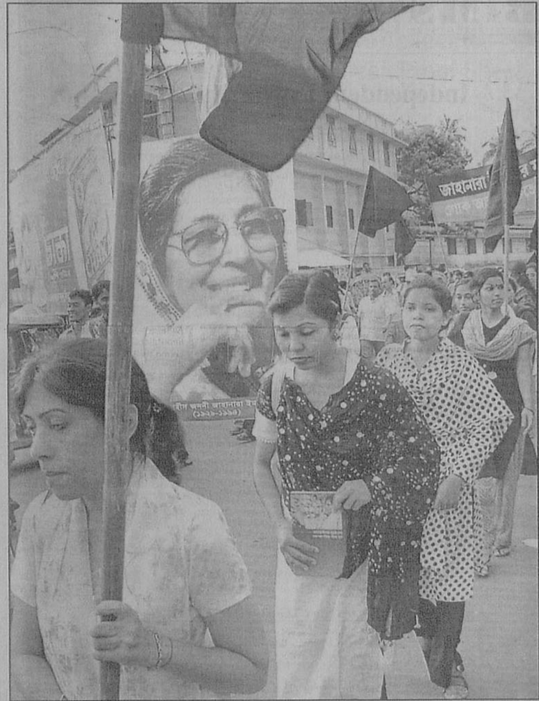
Cultural activists brought out a procession in Chittagong city yesterday marking the 12th death anniversary of Shaheed Janani Jahanara Imam.

Even, the authorities are yet to settle realisation of compensation for the burnt out gas as well as the environmental damage, which has been estimated by a high level technical committee formed by the government.