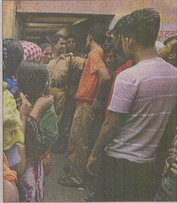
Anxious relatives of the detainees were desperate for news at Dhaka Central Jail about their near and dear ones.

Ila Chanda also said some people were shown arrested in false criminal cases including