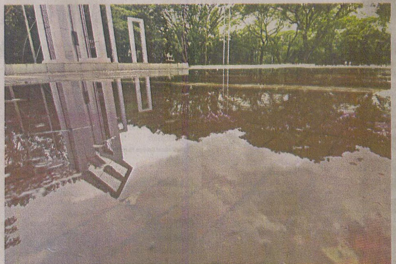
Due to lack of proper drainage system, water-logging on the premises of Central Shahid Minar is a common sight on rainy days.

BRTC now operates 789 buses, including 50 Volvos, 305 double-deckers, on 150 routes throughout the country and all the buses have at least two seats reserved for people with any form of disability without any fare.