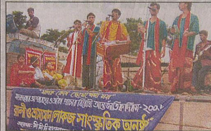
Artistes campaign on an open truck on drug awareness

A three-day campaign began in Rajshahi recently. The campaign was held in observance of the International Day against drug abuse and illicit trafficking. The function was organised by development organisation CCD Bangladesh, its affiliate Youth Voice and Bangladesh Advanced Students Alliance (BASA). The programme was also supported by the National AIDS/STD Programme and UNICEF to raise mass awareness on these social ills, says a press release.