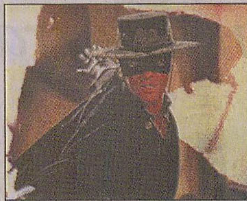
The Mask of Zorro On HBO at 09:30pm Genre: Action/Adventure Cast: Anthony Hopkins, Banderas, Zeta-Jones

All programmes are in local time. The Daily Star will not be responsible for any change in the programme.