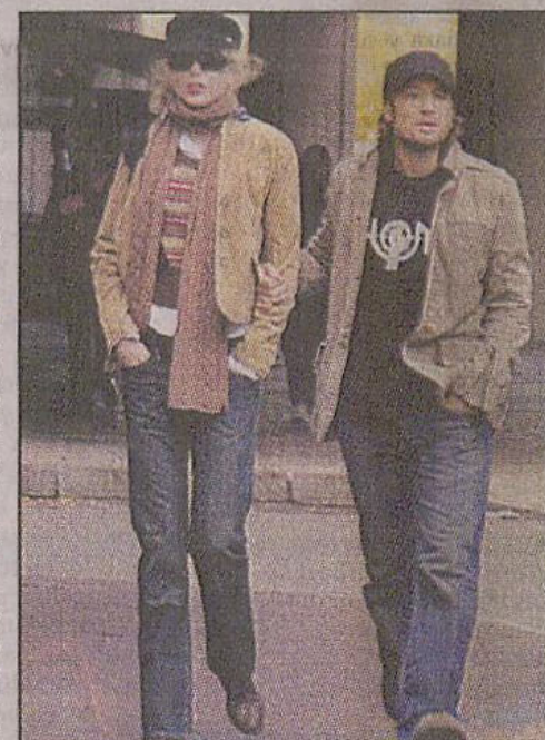
Nicole Kidman and Keith Urban

Kidman and Urban, both Australians but born overseas, met in January 2005 at an awards dinner held by the Australian government in Los Angeles honouring the two of them.