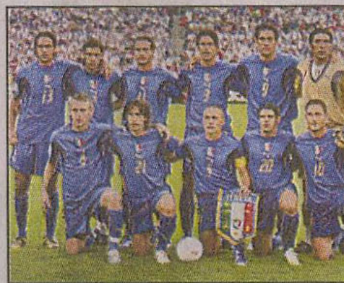
FIFA World Cup 2006 On BTV at 08:50pm Italy Vs Australia Live from: Kaiserslautern