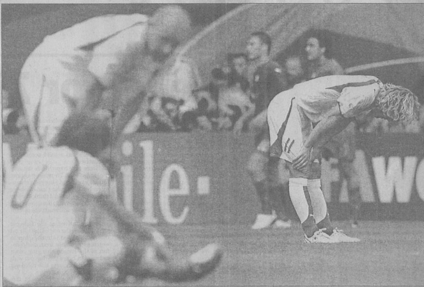
Czech Republic were one of the biggest disappointment of the World Cup 2006. Playmaker Pavel Nedved (R) and his Czech teammates look dejected after their elimination following a 2-0 loss to Italy on Thursday in Hamburg.

Spain and Ukraine qualify for second round