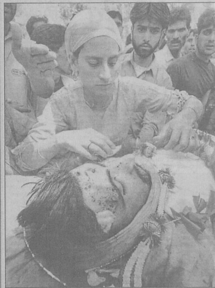
An Indian Kashmiri Muslim woman mourns over the body of a suspected Islamic militant who was killed in a shoot-out near Srinagar yesterday.

India's Hindi films have been banned in Pakistan for 40 years, but warming ties between the two arch rivals have resulted in a partial lifting of the ban.