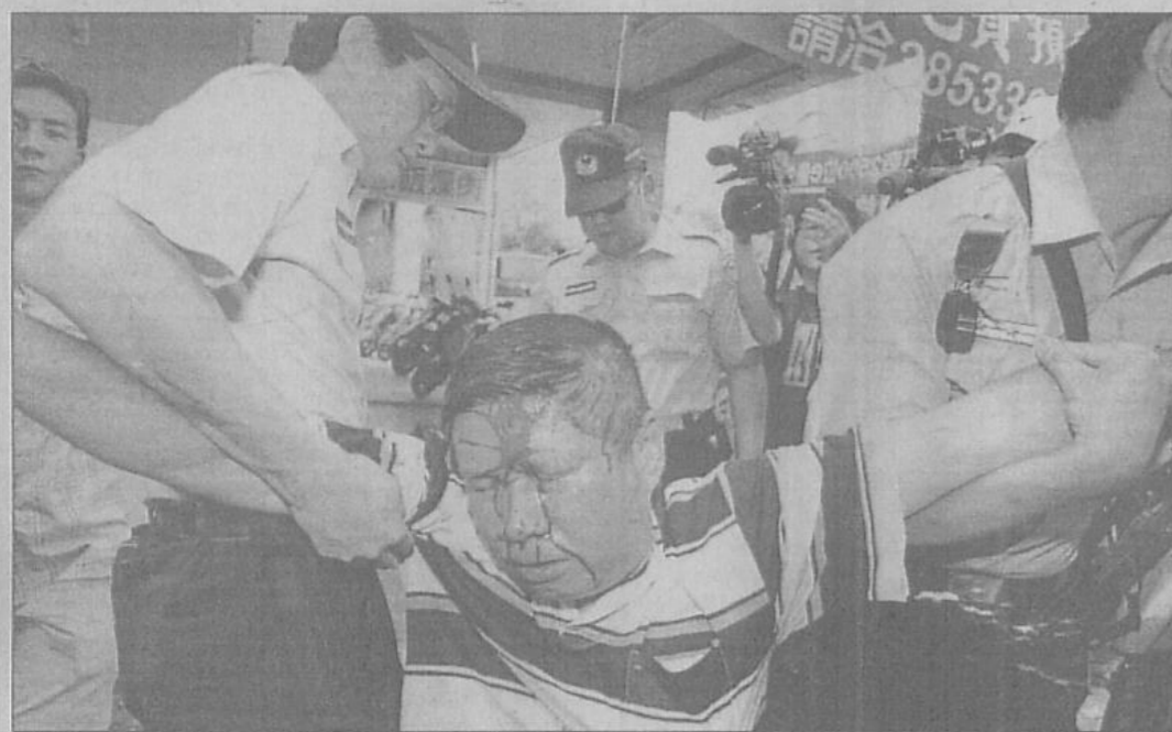
A bleeding supporter of President Chen Shui-bian is carried by policemen after a fellow supporter beat him during a rally in Taiwan. Thousands of protesters took to the streets yesterday calling for the resignation of Chen over a string of corruption scandals.

He had sacked the government and assumed direct control in February 2005, in a widely criticised move, that he said was justified as political parties were corrupt and had failed to stem the decade-long bloody insurgency.