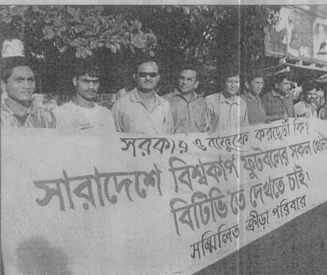
Sammilito Krira Paribar, an organisation of sports organisers, formed a human-chain in the city yesterday to protest Bangladesh Football Federation and government's dubious stance on Bangladesh Television's FIFA World Cup coverage.

TEN Sports West Indies vs India Third Test, Day Three Live at 8:00 pm