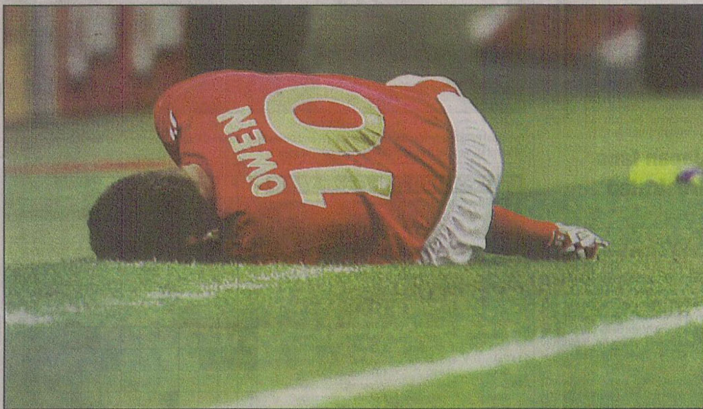
DOWN AND OUT: English striker Michael Owen, who was ruled out of the World Cup, lies on the pitch after badly injuring his right knee during their match against Sweden on Tuesday in Cologne.