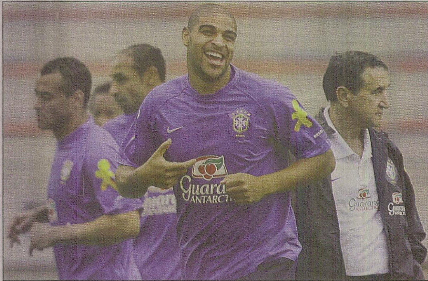
EMPEROR READY TO STRIKE AGAIN: Brazilian forward Adriano smiles during a training session at Bergisch Gladbach stadium while captain Cafu (L) and coach Carlos Alberto Parreira (R) look opposite ways on Tuesday ahead of their match against Japan.