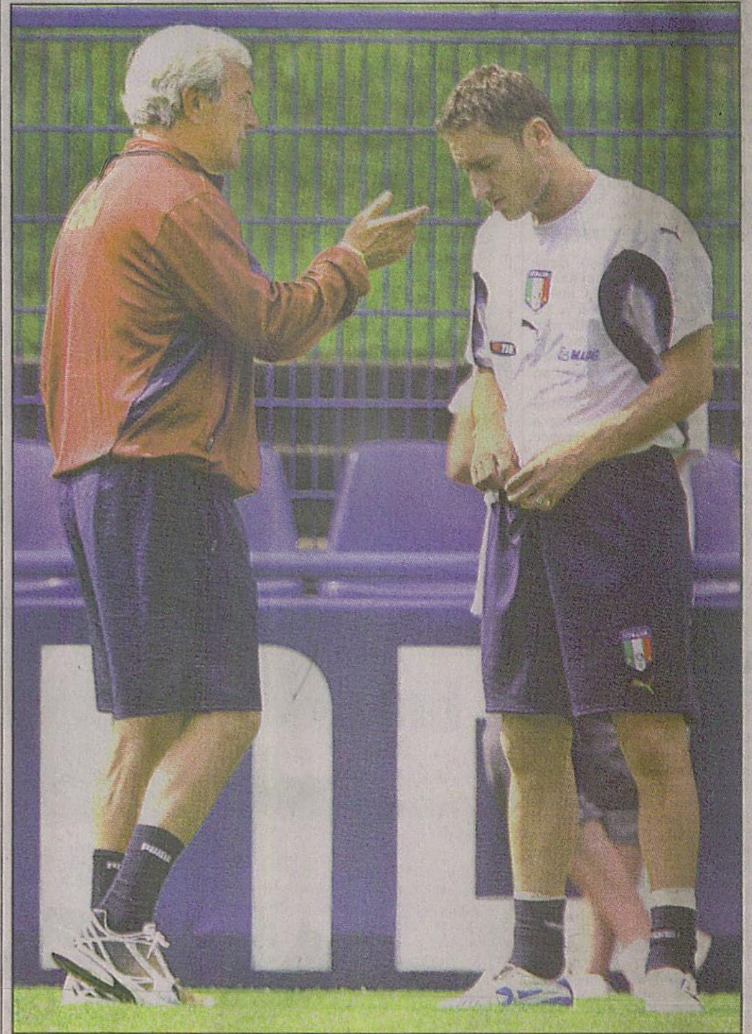
Italian coach Marcello Lippi (L) makes a point to his striker Francesco Totti during the team's practice in Duisburg on Monday. Italy face off with Czech Republic in their final Group E match in Hamburg today.