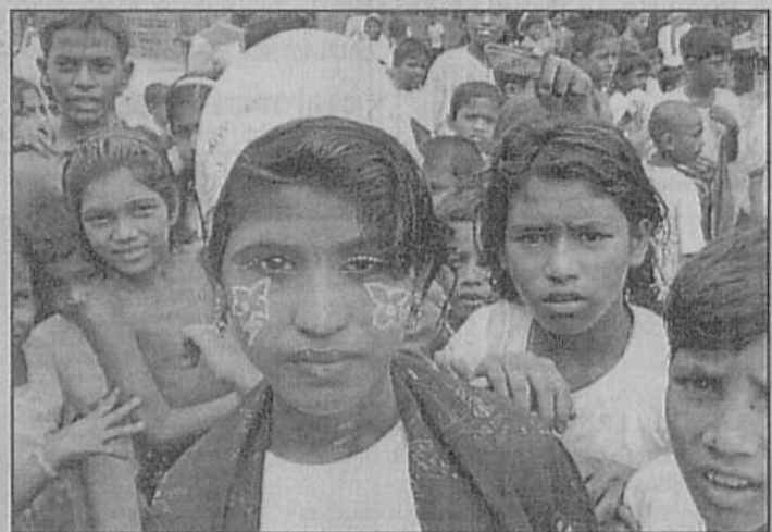
Rohingya children celebrated the World Refugee Day at Kutupalong Refugee camp in Teknaf yesterday.