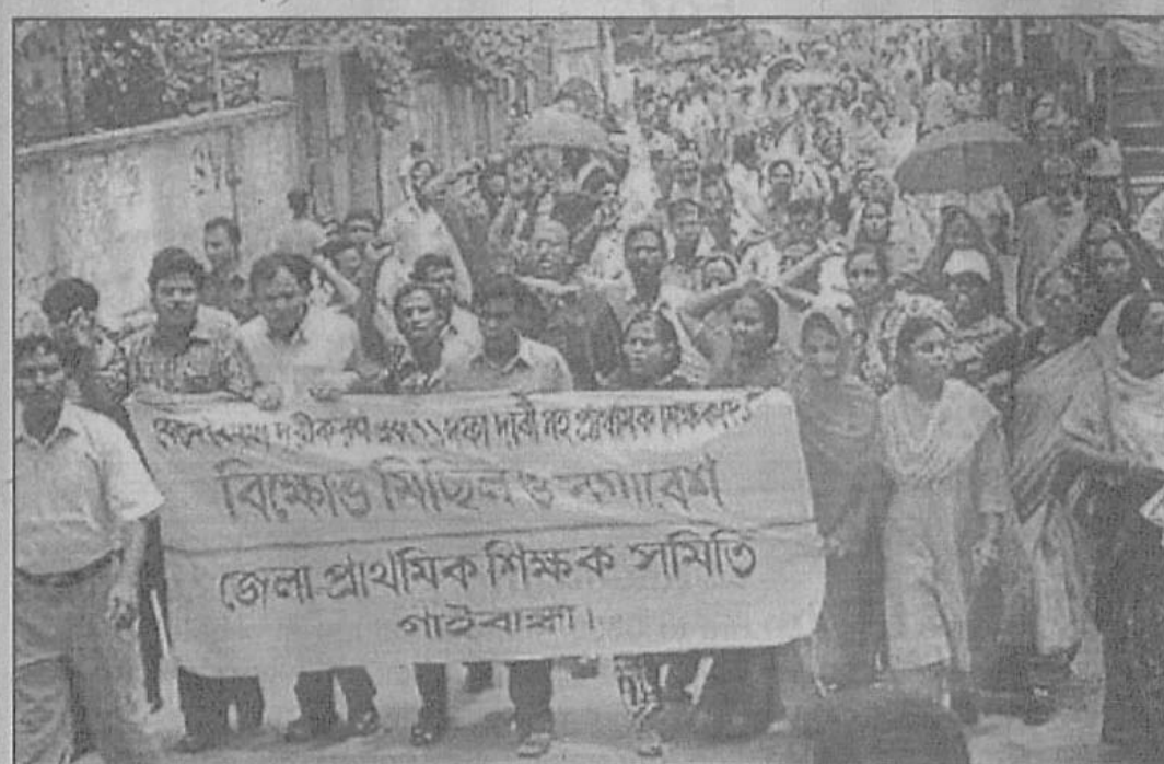
Gaibandha Districts Primary Teachers Association took out a procession in the district town yesterday demanding immediate realisation of their 21-point demand.