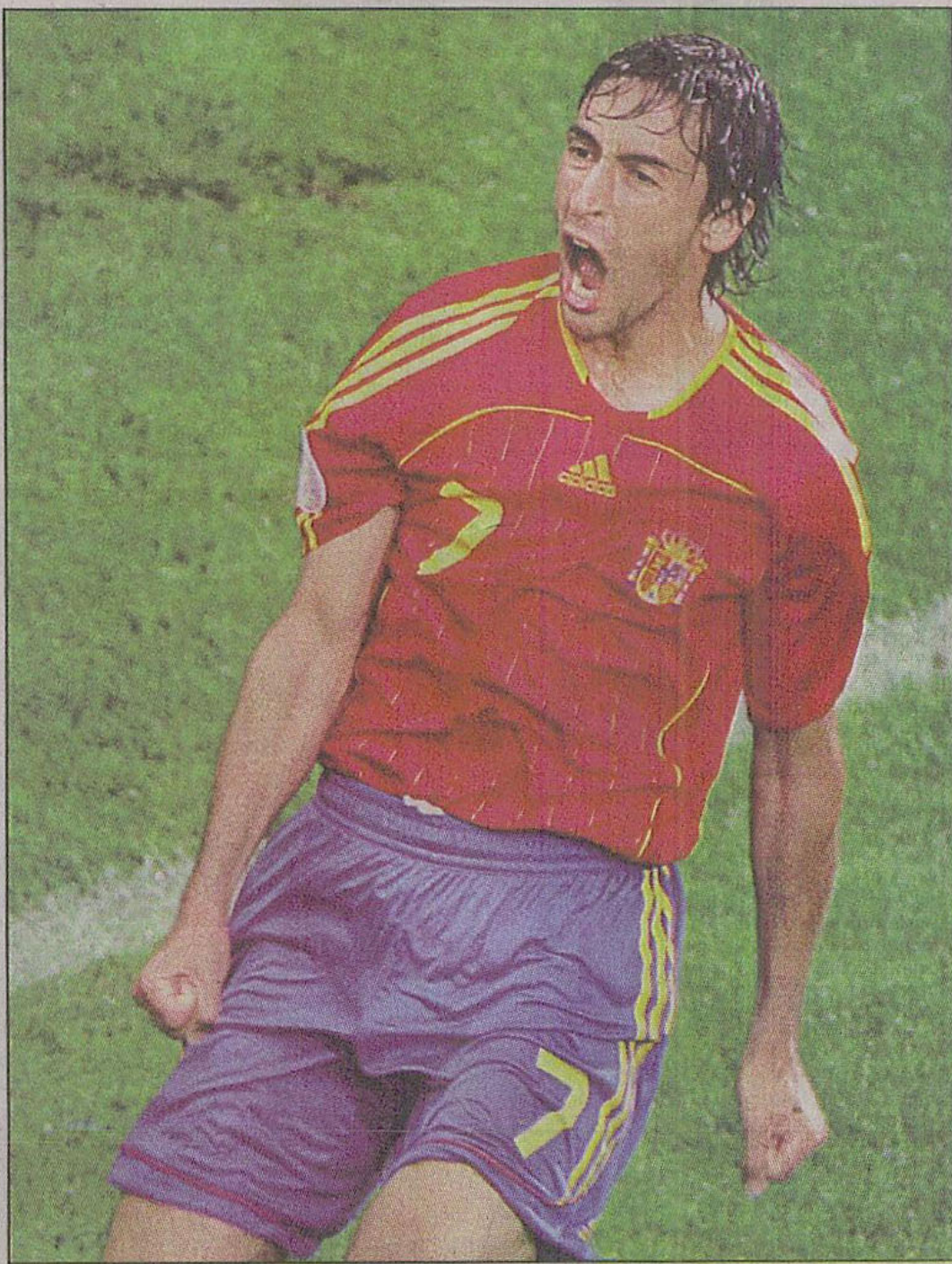
Spanish forward Raul celebrates after his equaliser against Tunisia at Stuttgart's Gottlieb-Daimler Stadium on Monday.

He said that the win over Saudi Arabia, combined with the morale-draining loss to Spain, would take some time to recover from.