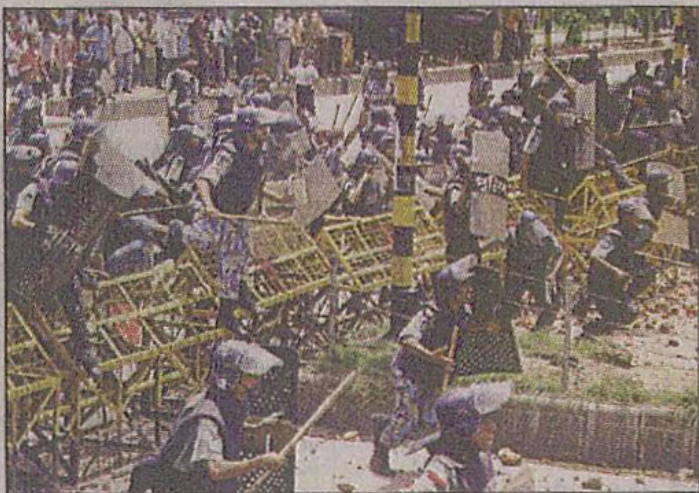
FROM LEFT... Police chase the opposition activists by going over the barricade they had set up to prevent the opposition from marching through during the 14-party's Election Commission siege programme yesterday. Police and 14-party activists clash on Rokeya Sarani near ADB Bhaban in the capital.