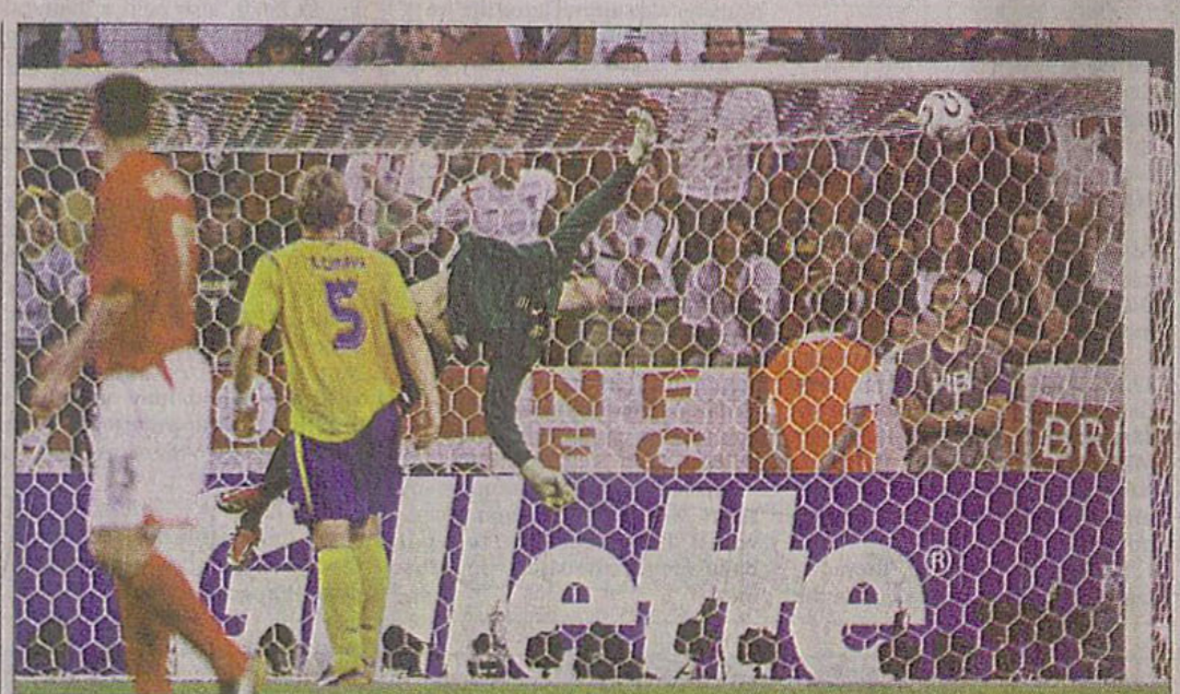
Swedish goalkeeper Andreas Isaksson (R) dives in vain as English midfielder Joe Cole (not in picture) scores during their match in Cologne yesterday.