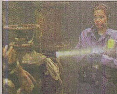
The Bone Collector On HBO at 09:30 pm Genre: Suspense/Thriller Cast: Angelina Jolie, Denzel Washington