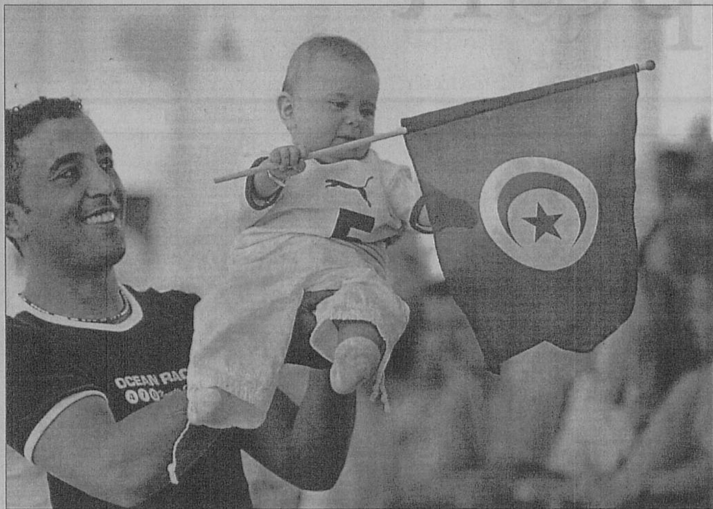
A young Tunisian fan waves a flag during the African nation's training session at Saks Stadium in Schweinfurt on Saturday ahead of their match against Spain.