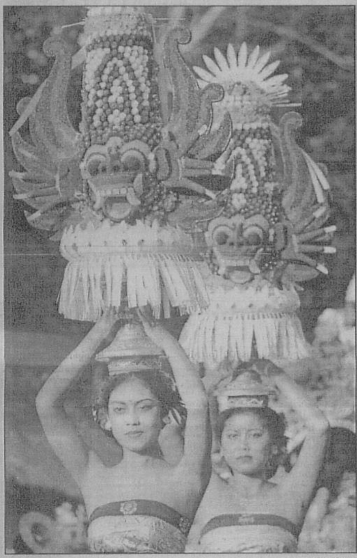
Balinese dancers perform during an art festival in Denpasar, to increase tourism which has suffered since the two Bali bombings.

AFP, Kandahar British troops said Sunday they had killed six Taliban rebels who had been firing mortars at one of Afghanistan's few functioning hydro-electric dams. British forces returned fire with mortars after they also came under fire late Saturday near the Kajaki dam and power plant in southern Helmand province, a British military spokesman said.