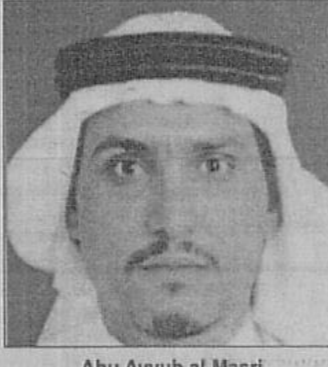
Abu Ayyub al-Masri