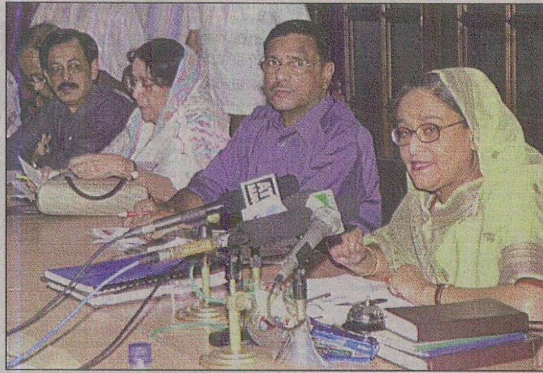
Awami League President Sheikh Hasina speaks at a view exchange meeting with party's grassroots level leaders of Comilla, Chandpur and Brahmanbaria at AL's Dhanmondi office in the city yesterday.