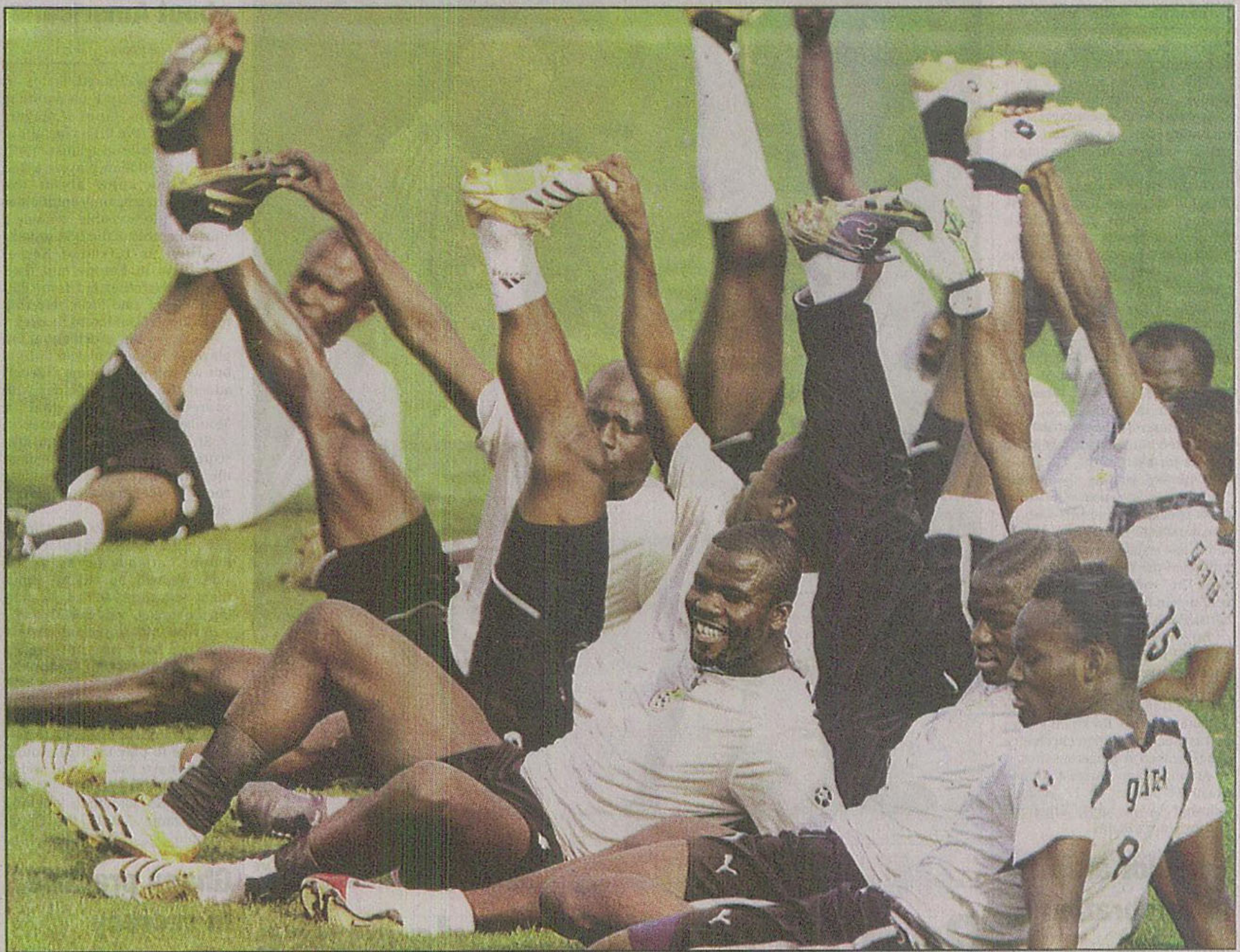
Ghanaian players stretch during training in Warzburg on Thursday.

"It is really sad for Milan and Jan, and before we lost Vladimir (Smicer, who was ruled out of the tournament before it had begun) but we have to get on with things and we can use it as an extra motivating factor," said the 25-year-old.