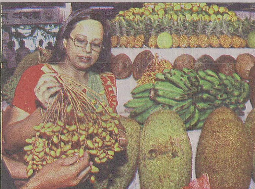
A visitor takes a look at dates at a three-day fruit exhibition that began on the Krishibid Institution premises in the capital yesterday.