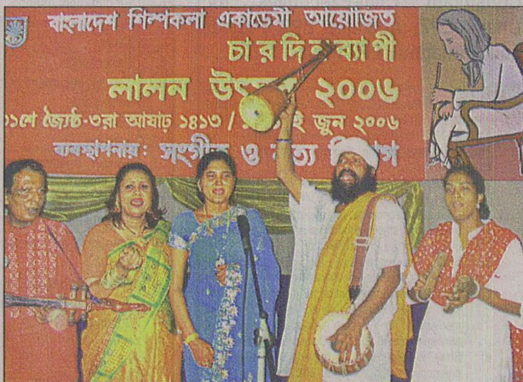
Lalon singers performing on the first day of the festival

15 singers rendered Lalon songs in the opening day. The