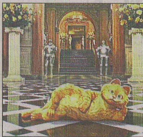
A scene from the movie

But when Garfield (voiced again by a droll, hilarious Bill Murray) discovers his owner, Jon (Breckin Meyer in a reprise), is proposing to veterinarian Liz (Jennifer Love Hewitt, also back again), he has a jealous fit. So he and Odie stow away on the London-bound flight Jon is taking to propose overseas.