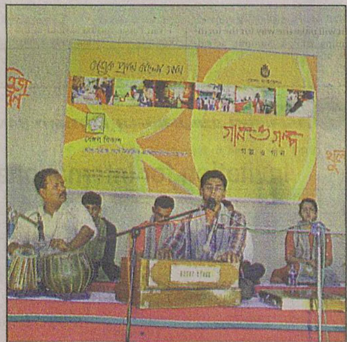
A contestant performing at the programme

Bengal Foundation is holding a similar programme featuring the finalists from Chittagong division. The programme will be held today at Chittagong Theatre Institute.