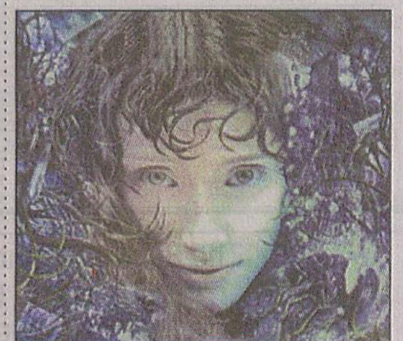
Lady in the Water