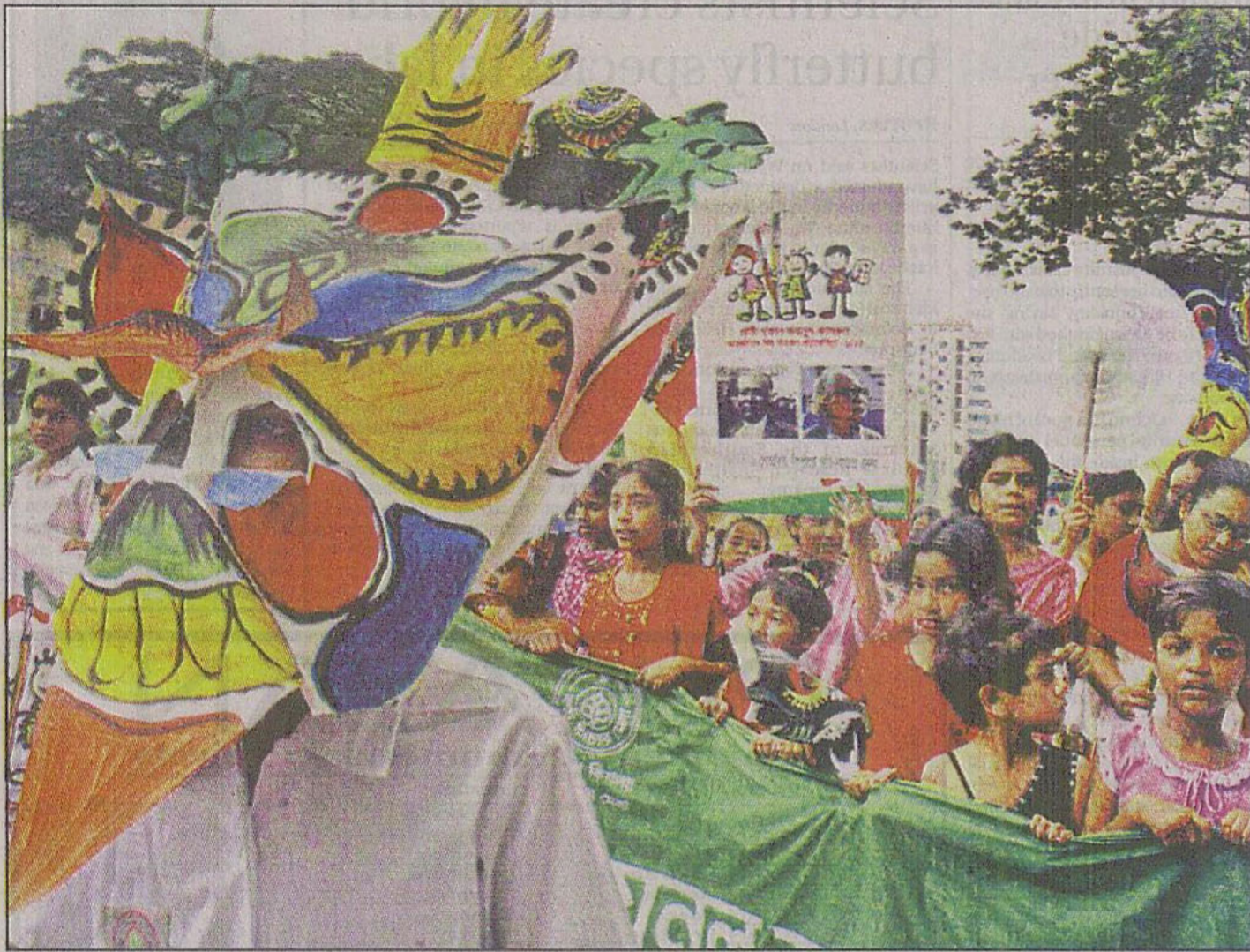
A colourful procession was brought out in the city yesterday to mark the 'GrameenPhone Zainul-Kamrul International Children's Art Competition'.