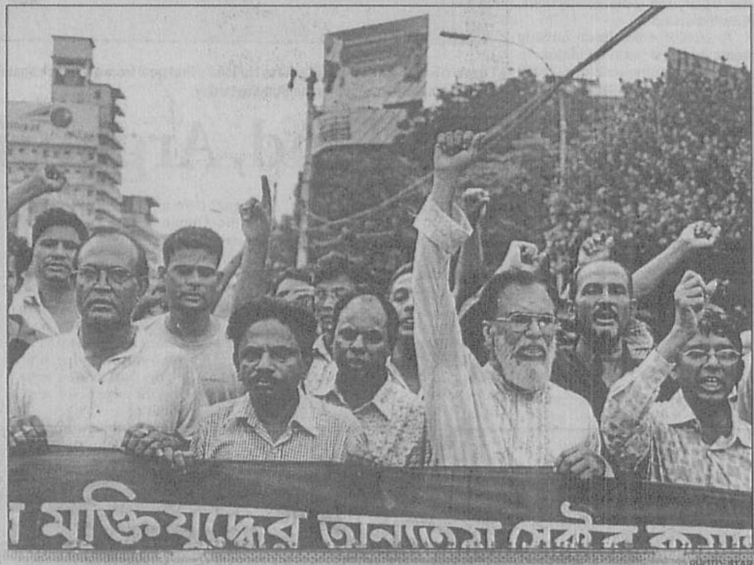
Muktijoddha Kalyan Foundation stages a demonstration at Muktangan in the city yesterday protesting police attack on former army chief General KM Shafiullah.

All of the arrested are accused of a number of criminal cases with different police stations.