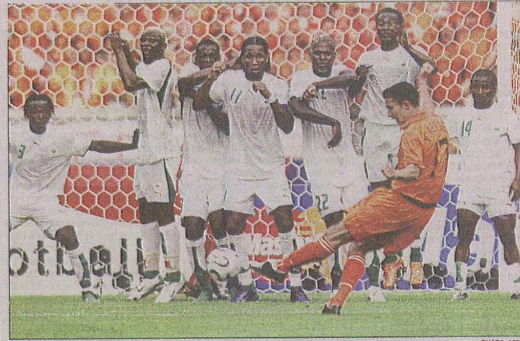
Forward Robin van Persie (R) scores Holland's first goal from a freekick against Ivory Coast in their Group C match at Stuttgart's Gottlieb-Daimler Stadium yesterday.

A UNDP consultant already made his first visit to Dhaka to assess the requirement for a UNDP secretariat to be set up here before the election. The planned secretariat will provide logistic support to