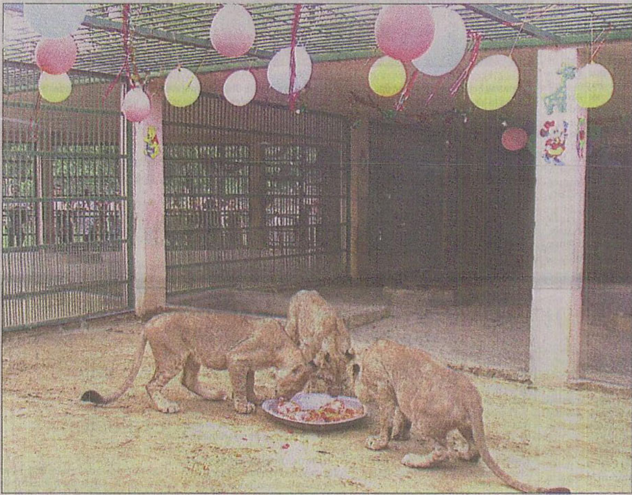
Three lion cubs feasting on a beef liver as the Chittagong Zoo authority arranged their first birthday celebration yesterday. The zoo decorated with balloons and flowers assumed a festive look on the rare occasion that offered the viewers, especially children, a nice weekend to enjoy.