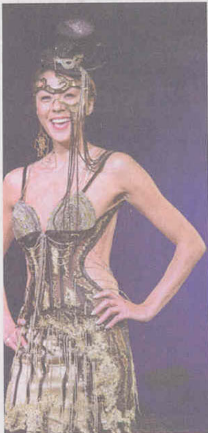
A Japanese model displays the 7,181 carat Diamond Dress during an diamond jewellery collection as part of "A Celebration of Miracles: Diamonds and Botswana" hosted by the diamond trading company (TDC) in Tokyo. Some 10 billion yen (88 million USD) worth and 10,000 carat Diamonds are on display at the collection.