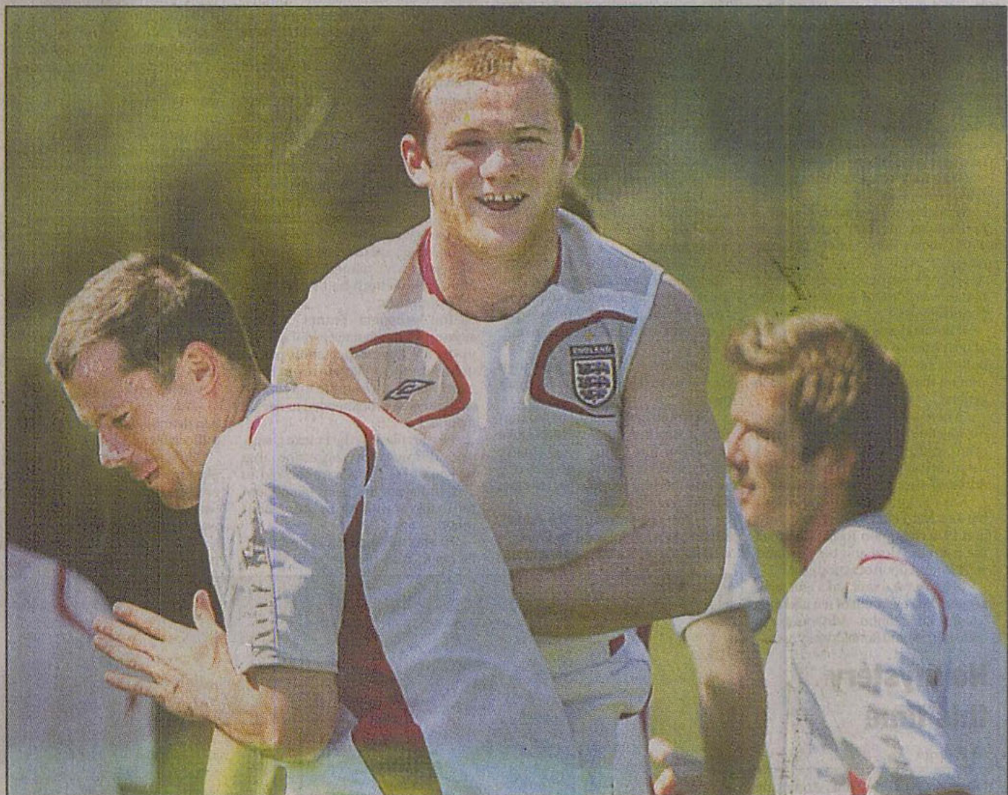
I AM GETTING IMPATIENT: English forward Wayne Rooney (C) jumps into defender Jamie Carragher during a training session at Mittelbergstadion in Buhlertal on Wednesday. Rooney is unlikely to play against Trinidad and Tobago today.