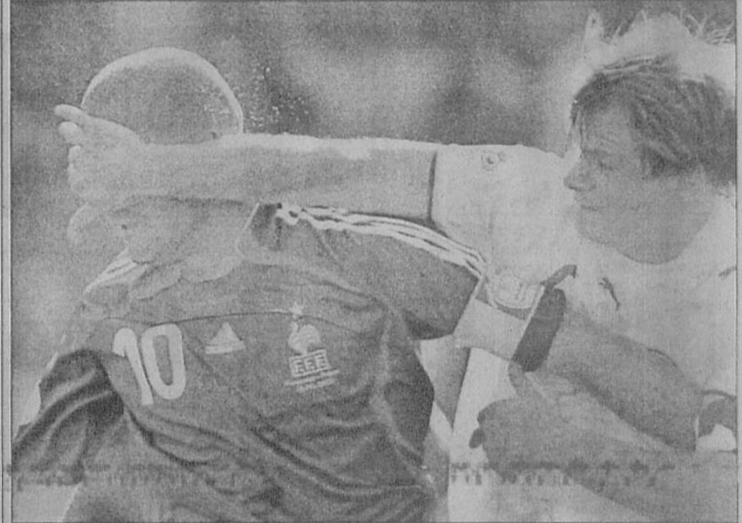
French midfielder Zinedine Zidane (L) vies with Swiss midfielder Johann Vogel during their Group G match in Stuttgart on Tuesday.

Observers claim that Argentine team officials like to cultivate an aura of mystery during Argentina's major international outings. But the media, World Cup officials and some locals have a less generous view of the squad's protected ways and haphazard sense of time at their base in Bavaria.