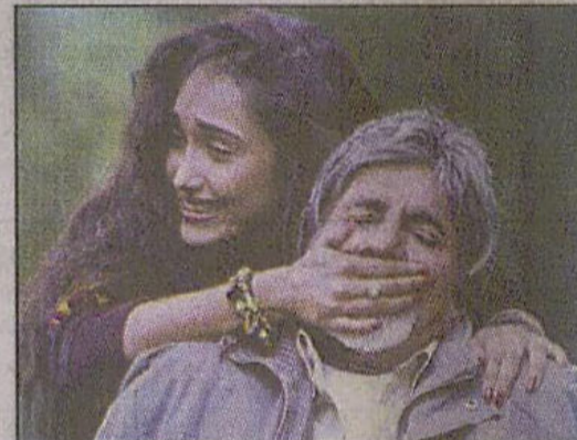
Newcomer Jiah and Amitabh in a scene from Nishabd. Time Machine to make time for Nishabd.

The director even gave Amitabh preference over Shah Rukh Khan, and shelved his Shahrukh-starrer