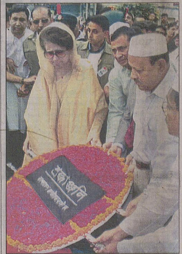
Prime Minister and BNP Chairperson Khaleda Zia and other party leaders place wreaths on the coffin of Women and Children Affairs Minister Khurshid Jahan Haque in front of the party office yesterday.

The fined vessels were MV Upasagar and MV Nur E Tabassum.