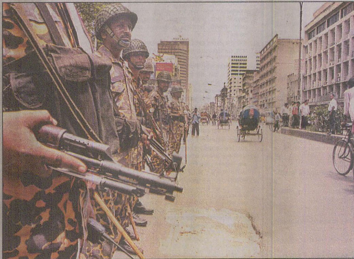
BDR members stand guard at Motijheel in the city during hartal hours yesterday.

Masayuki Inoue thanked the Foreign Minister for warmly receiving him and the assurances of cooperation during his tenure in Dhaka.