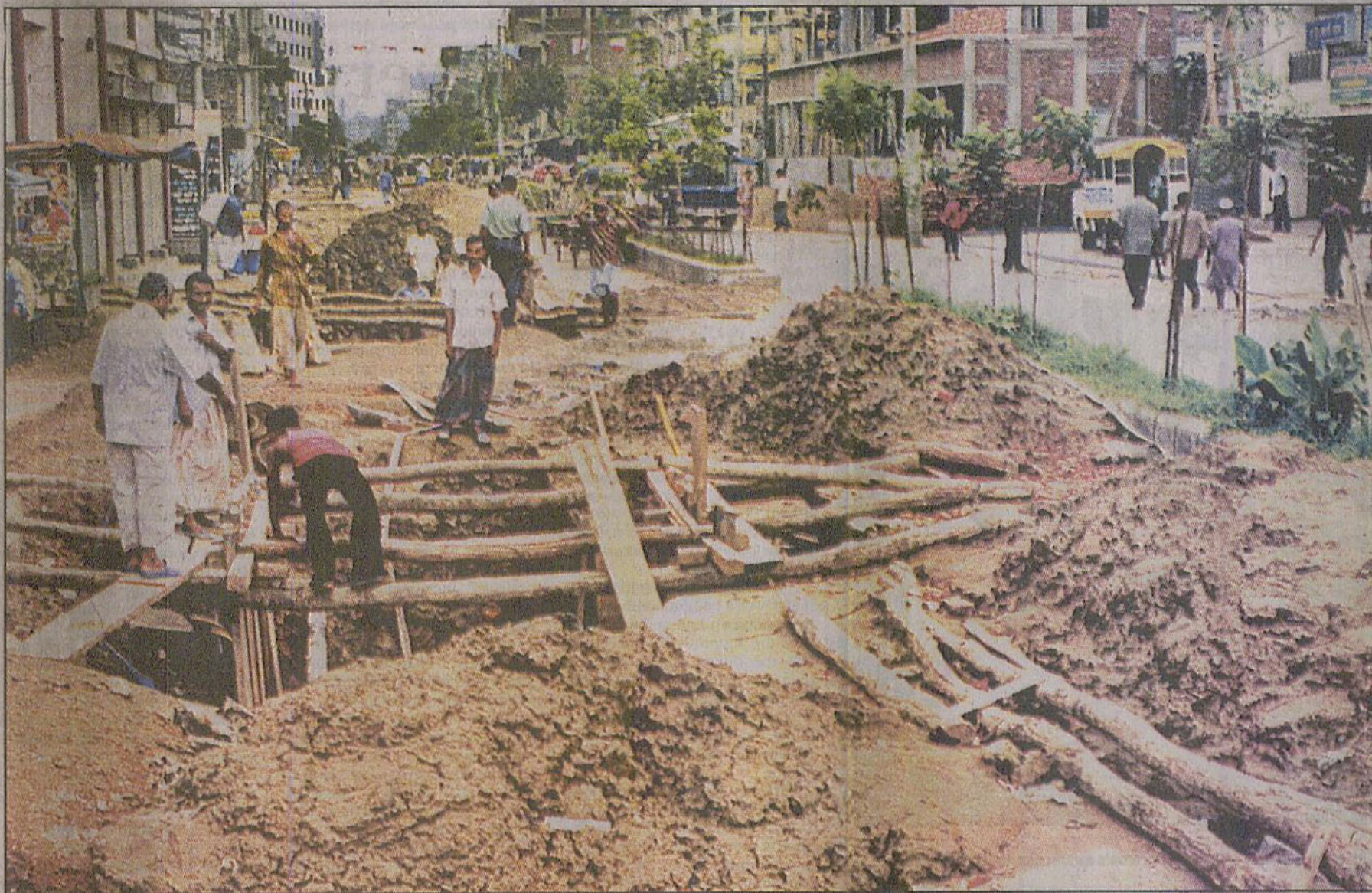
Work for installation of storm sewer lines at Dayaganj in the city has been going on for about two months, causing suffering to pedestrians as well as passengers.