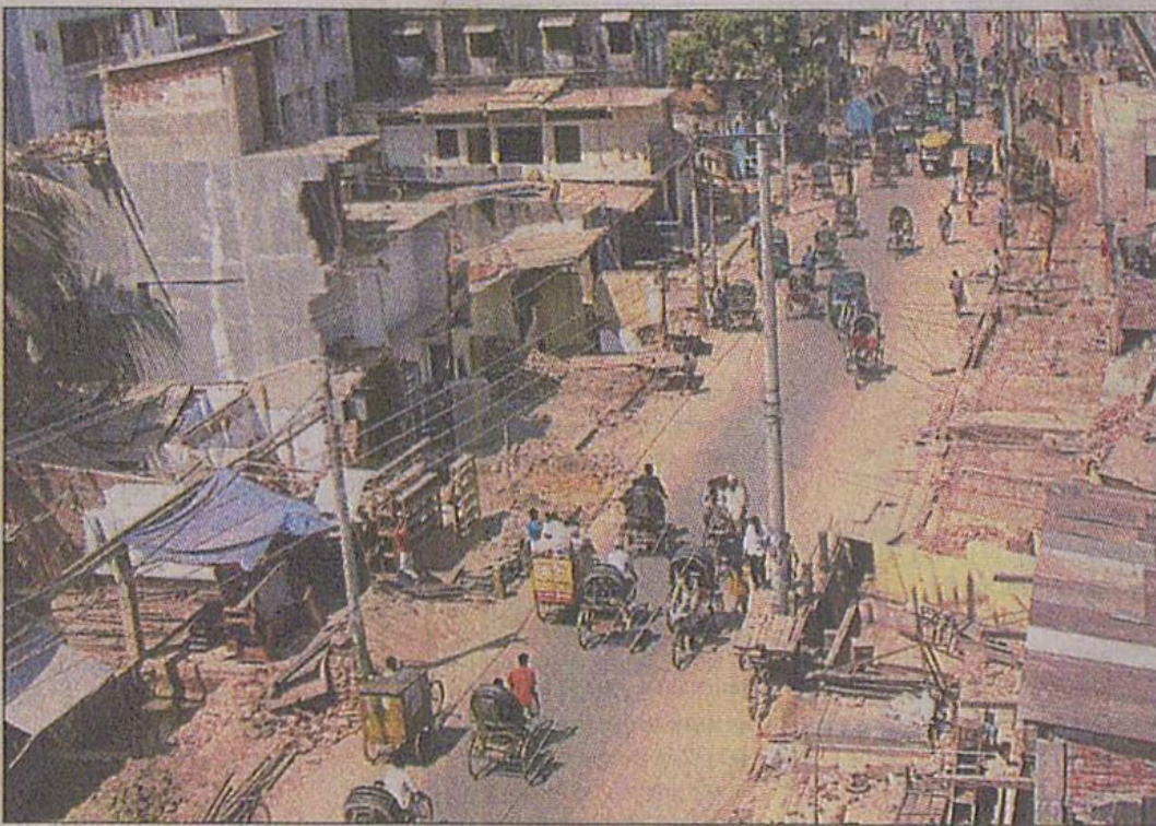
Illegal structures were demolished for expansion of Siraj-ud-Doula Road.

Under the Tk 86 crore CEPZ-Port Connecting Link Road (Port By-pass Road) project, a road will be constructed on the south-