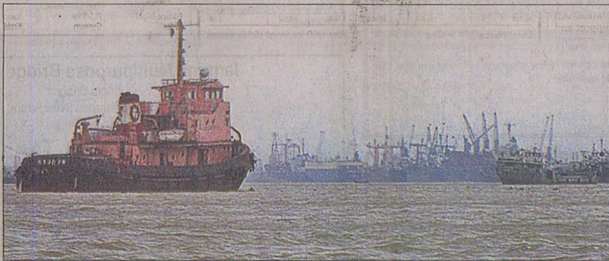
Chittagong port where once disposal of oily substance, right, was a common scene, now witnesses a remarkably improved environment, left.

Strong surveillance and continuous drive under Chittagong Port Law have succeeded in reducing pollution at different points of the river Karnaphuli to a remarkable extent and putting an end to open dumping of wastes into the water by vessels.