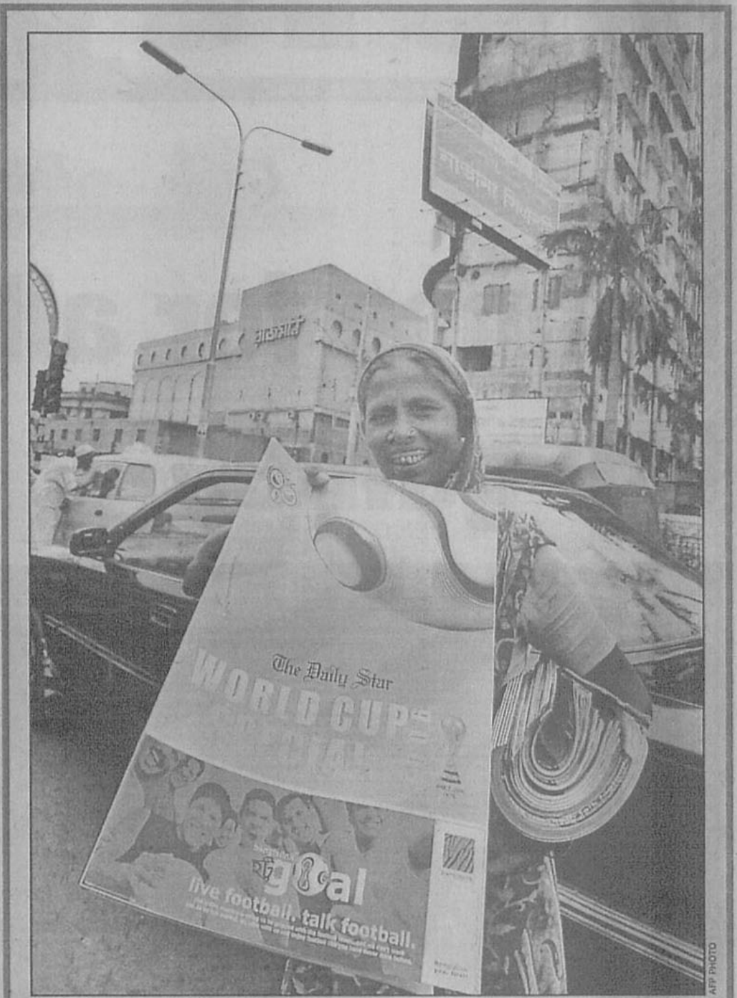
With the starting of World Cup Football, newspapers are not falling behind either. Their special publications on the event have been very popular among the readers. A woman hawker is seen selling such a supplement in front of Rajmoni cinema at Kakrail.

Appellate Authority," said Rajuk chairman. A top Rajuk official seeking anonymity said: "A section of corrupt officials facilitated approval for the construction of a high-rise building although the area is earmarked as an ancillary service zone." The landowner first obtained permission to use the land for commercial and residential purposes, said a Rajuk official, but he later got a plan passed for a fully commercial high-rise building suppressing information in the submitted plan. The city development authority has virtually divided over the issue of whether the plot on the Kemal Ataturk Avenue is in an ancillary service zone or if it can be used commercially with high-rise establishments. A total of 19 senior Rajuk officials residing at Rajuk officers' quarters (Banani Nibash) adjacent to the plot are against commercial high-rise buildings. A Rajuk engineer residing at the quarters said: "A rushed job on the foundation for high rise may cause comprehensive structure failure, as the concrete casting being carried out along with rain water will not be well set." Despite Rajuk's cancellation, the builder is going on with construction by virtue of the HC ruling.