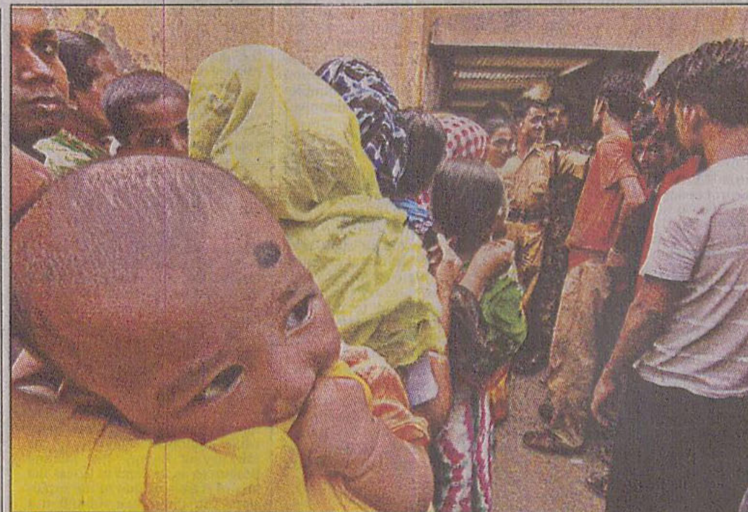
A mother cuddling her infant waits outside the Dhaka Central Jail yesterday as her husband was put behind bars in the wake of mass arrests by police before and during the June 11 Dhaka siege programme by the opposition.

The supplementary allocation has gone to 45 ministries and departments which have spent more than their original allocations in the current fiscal. The extra expenditure of the agriculture ministry is Tk 653 crore, while the