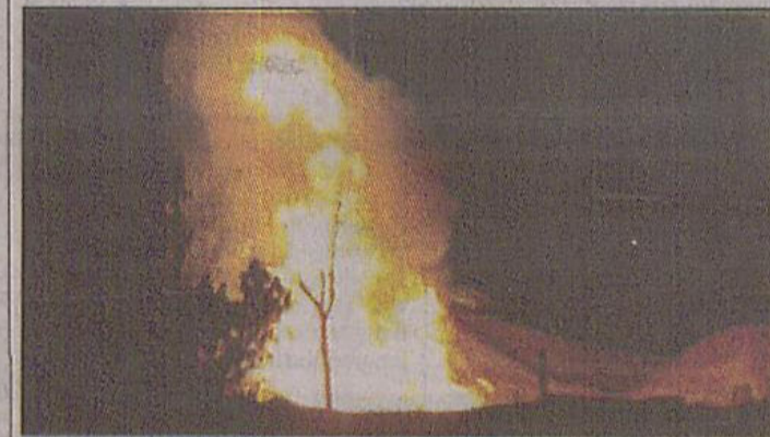
The photograph shows how fire burned depleting gas reserves after Magurchhara gas field explosion nine years ago.