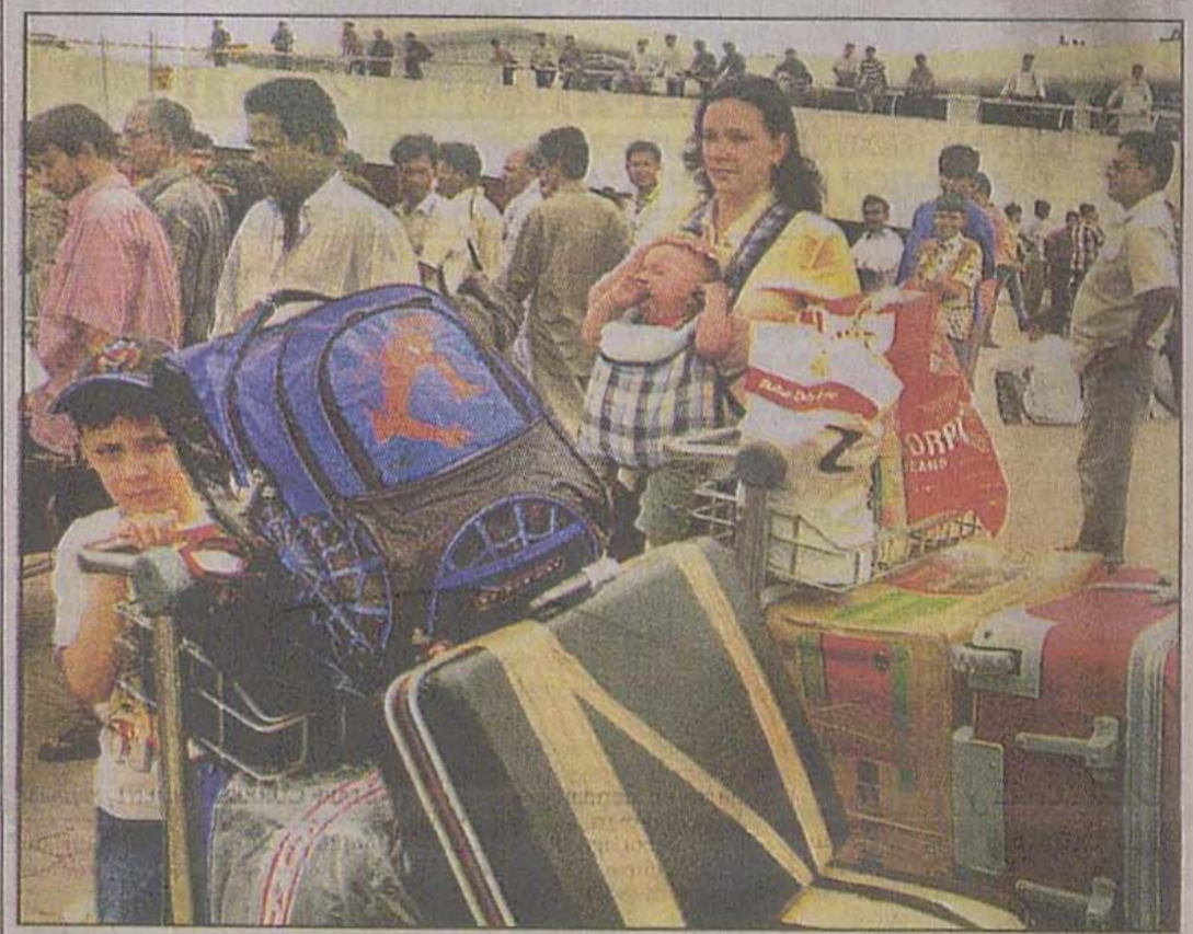
A foreign national and other home-bound passengers with their luggage wait outside Zia International Airport in the city during hartal hours yesterday as they find it difficult to get any transport to reach their destinations.

This would involve identifying priority sites within Dhaka that are likely to affect the city's storm water drainage, and to ensure coordinated efforts between DWASA, Dhaka City Corporation and the residents in those areas.