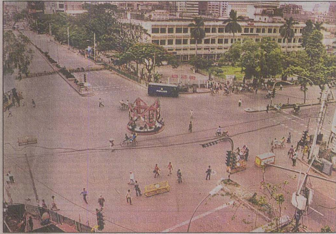
Zero Point area in the city looks deserted during hartal hours yesterday. The 14-party opposition combine enforced a countrywide 36-hour shutdown from 6:00am yesterday to press its demands for electoral reforms and resignation of the chief election commissioner.