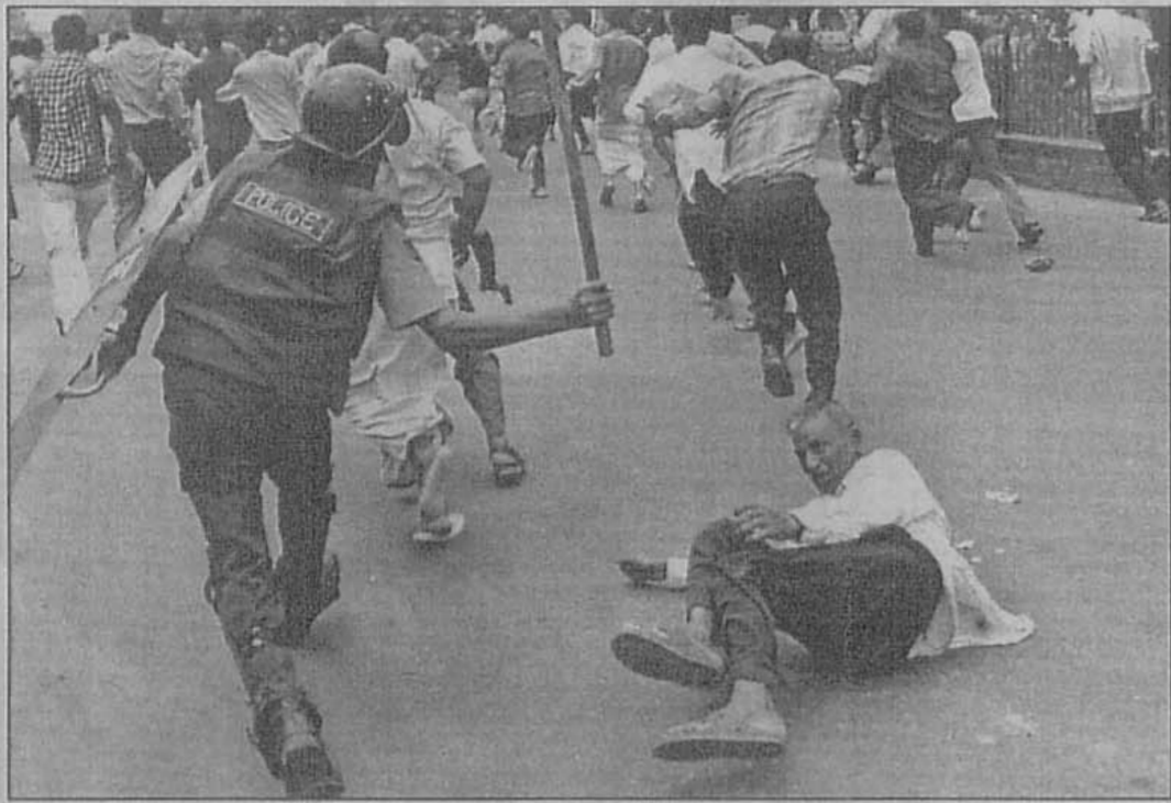
Police baton-charge the opposition activists near Sobhanbagh mosque in the city as they were marching in a procession during hartal hours yesterday.

To mark this occasion, food will be distributed among the destitute in the morning, and a milad mahfil will be held at Shaheh Bari in Hajiganj after Asr prayers.